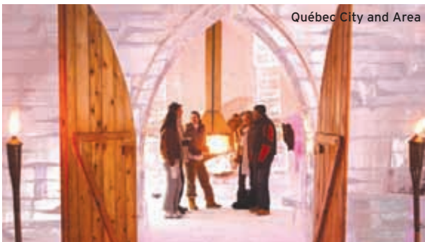
Québec City and Area