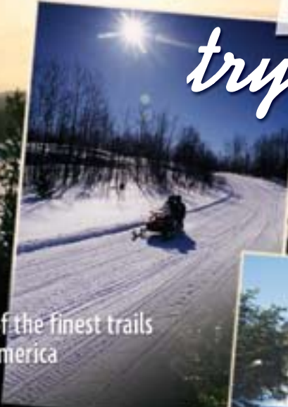
3 700 km of the finest trails in North America