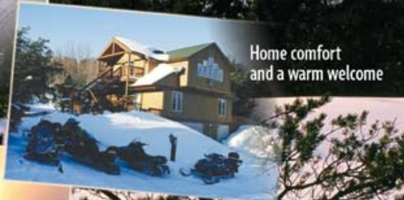
Home comfort and a warm welcome