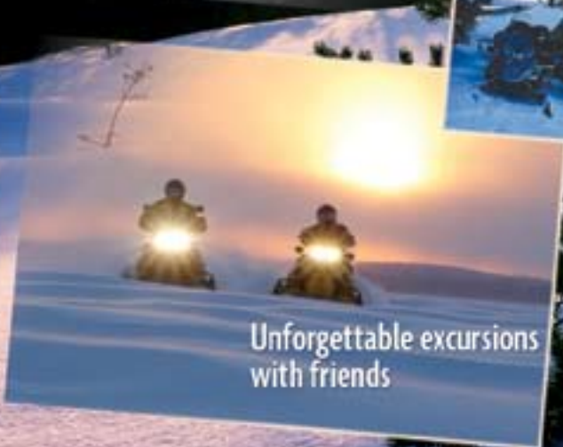
Unforgettable excursions with friends