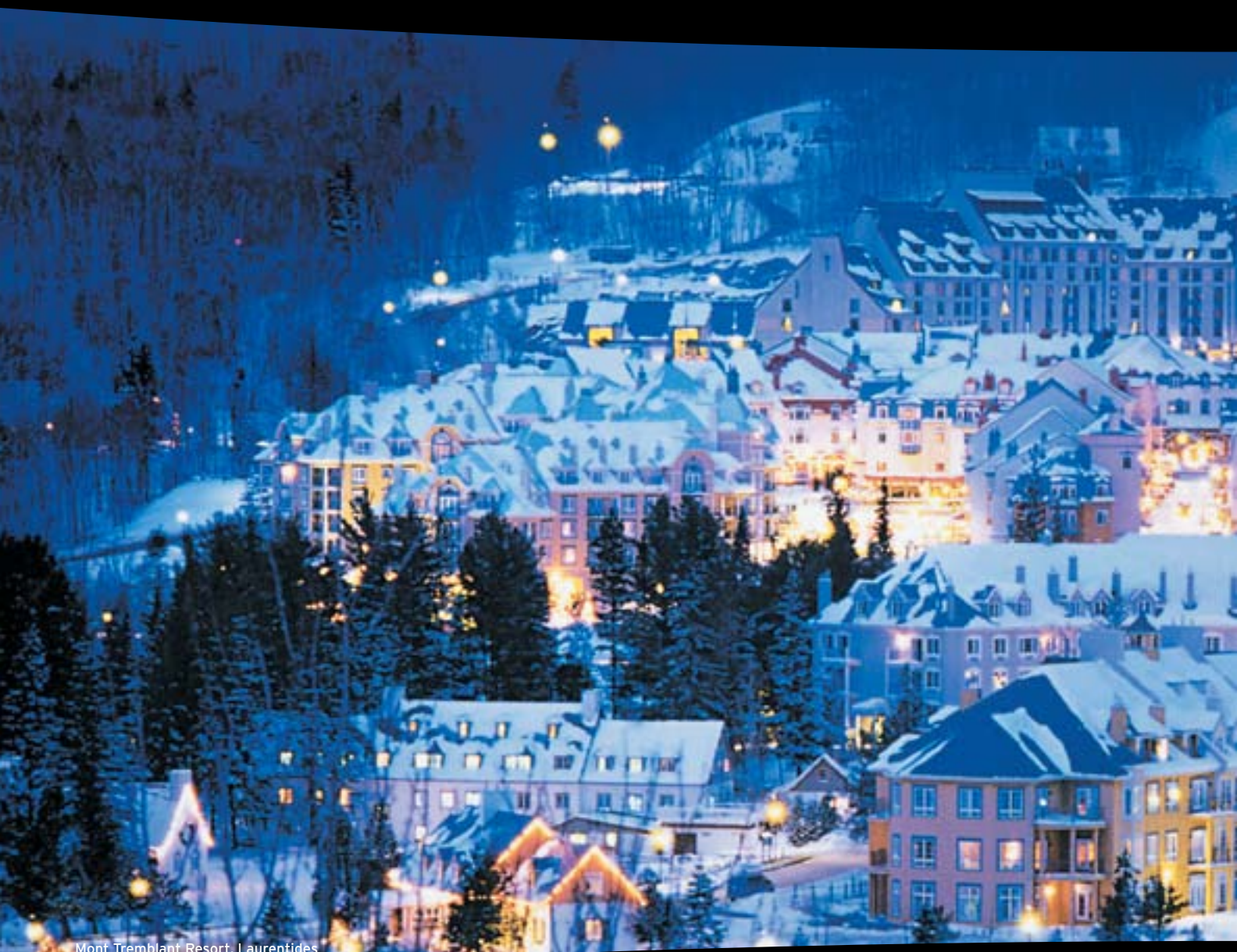
Mont Tremblant Resort, Laurentides

For information and reservations: bonjourquebec.co.uk Freephone number: 0800 051 7055