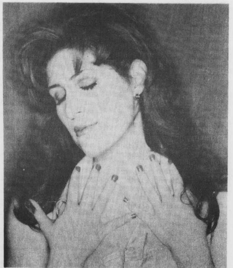
Jo Dee Messina... a young woman in search of freedom, passion, love and adventure.