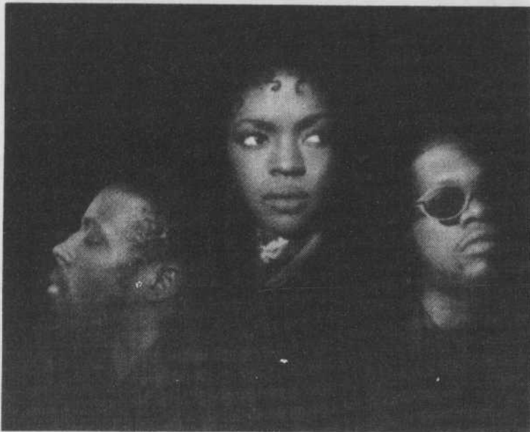
Wyclef Jean, Lauryn Hill and Prakazrel Michel are the Fugees.

stunning commercial success, leaving Hill and partners Wyclef Jean and Prakazrel Michel rubbing elbows at the top of the charts with Alanis Morissette and the Beatles.