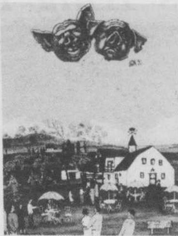
A delightful depiction of North Hatley by Naisi LeBaron is featured on the poster for the Piggery's 31st season.

If they're not flat-out Dead Together , they're simply Wrong For Each Other (July 18 to August 3). After Rideout's play gets its Quebec premiere, it's time for a sentimental