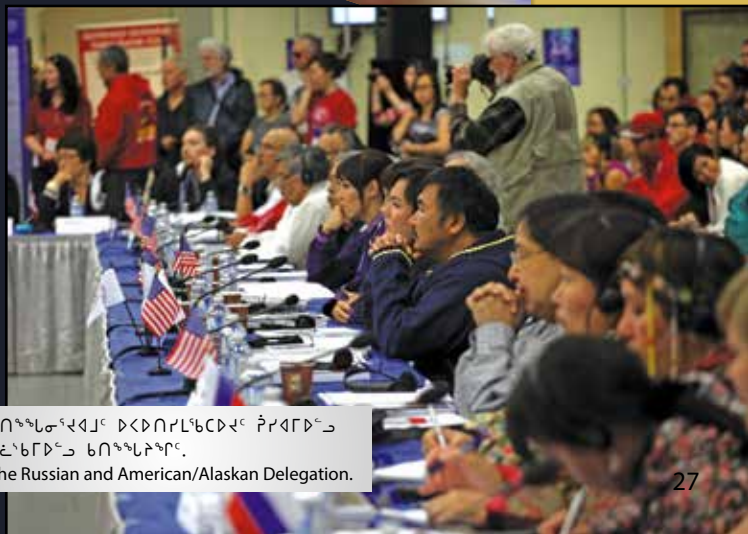
ᕿᕿᕿᕿᕿᕿᕿ ᐃᕿᕿᕿᕿᕿᕿᕿ ᕿᕿᕿᕿᕿᕿᕿᕿ. The Russian and American/Alaskan Delegation.