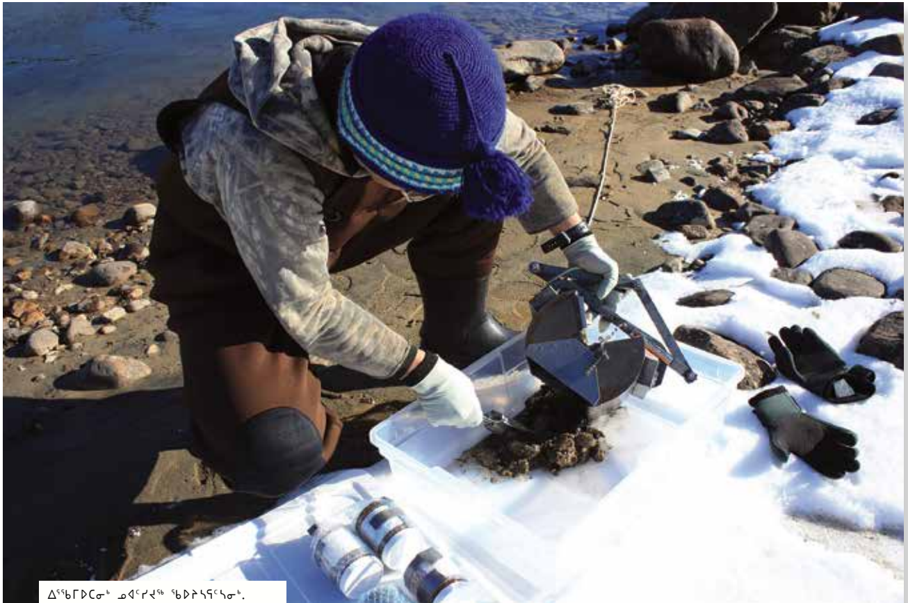
ᐱᓃᓃᓯᐱᓄᓃᓯᓃ ᓄᓴᓯᐱᓄᓃᓯᓃ ᓃᓅᐱᓴᓯᓃᓃᓯᓃ. Collecting sediment samples for analysis.

It is an important tool to gauge the extent of impacts such human activities have on the environment by comparing data before, during and after such activities. Environmental quality guidelines established by government agencies such as the Canadian Council of Ministers of the Environment (CCME) are used as reference points to assess if contaminant levels exceed acceptable guidelines, hence harmful due to such activities. Baseline studies are carried out in Nunavik, where mining has the potential of becoming more important in the near future.