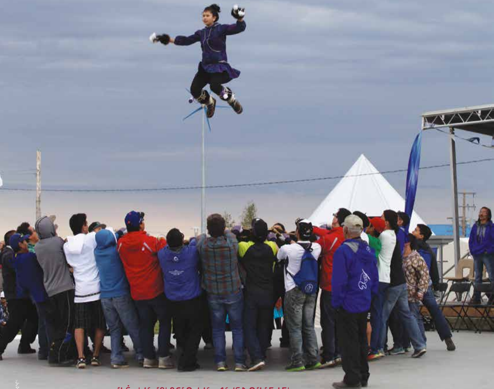
ԳԵՃՆԸ ԳԲԻՐՇՈՐԻՐԸ, ԳԵՐԳԾՈՆԵՂՂԻ ԲԵՇԻՇԻՐՆԵՒ ԳԵՆԵՂՇՈՇԸ Blanket toss, or nalukatak in Alaska.