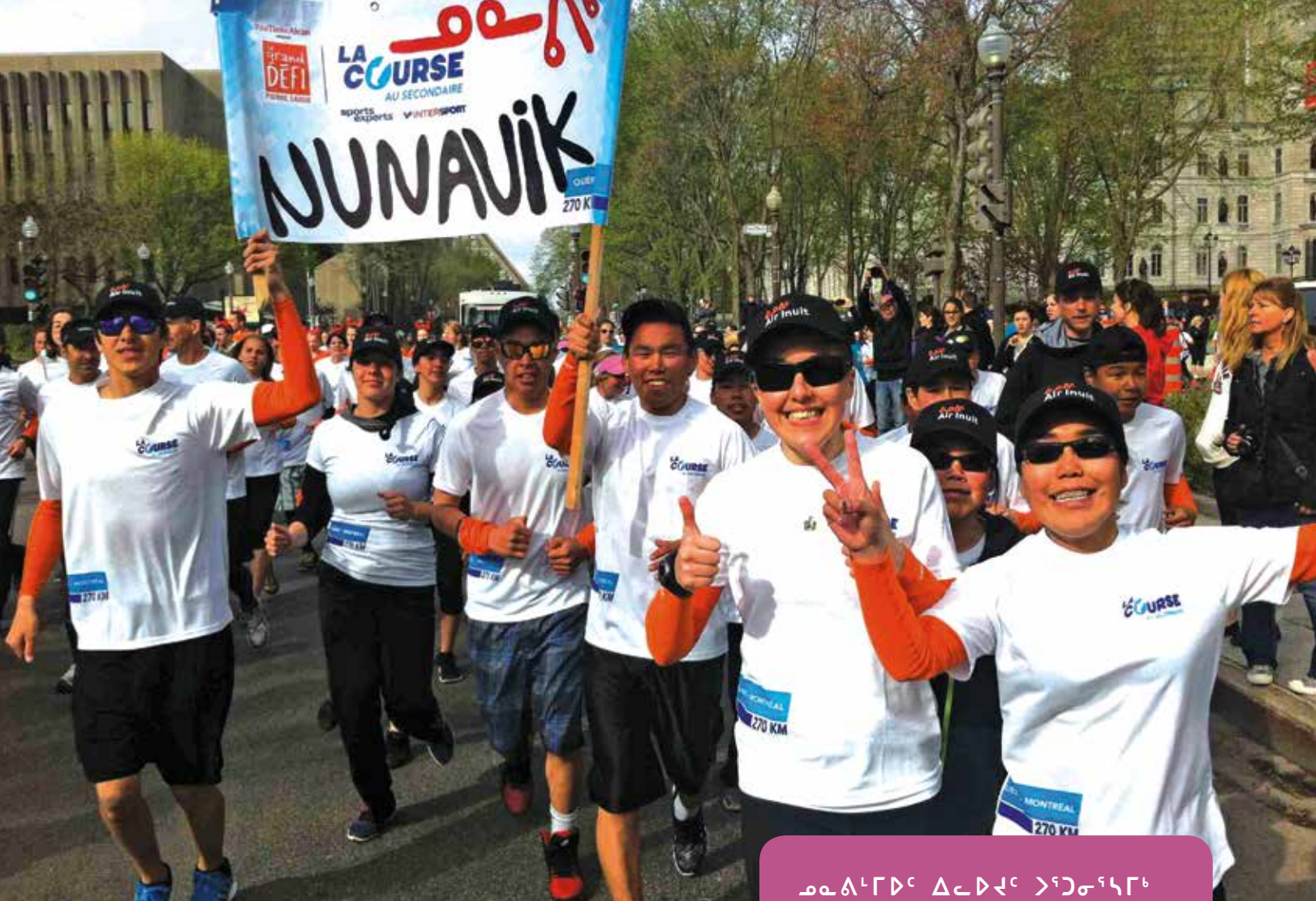
መልካም ልዩ ልዩ ኃይል ያገኙ ለ ልማት ላይ ካሉ የሥራ ጉዳዮች ላይ ከተቆዩ ለማይሰሩ አይሰሩም። Nunavik participants of La Course au Secondaire persevered and didn't give up.