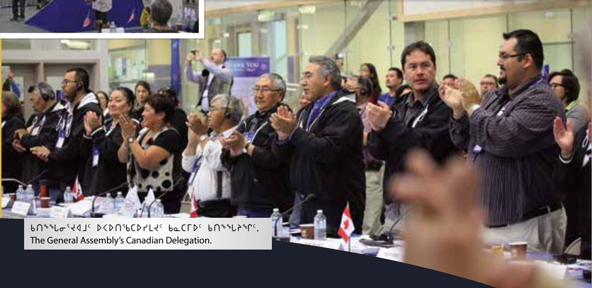
ᕿᕿᕿᕿᕿᕿᕿ ᐃᕿᕿᕿᕿᕿᕿᕿ ᕿᕿᕿᕿ ᕿᕿᕿᕿᕿᕿᕿ. The General Assembly's Canadian Delegation.