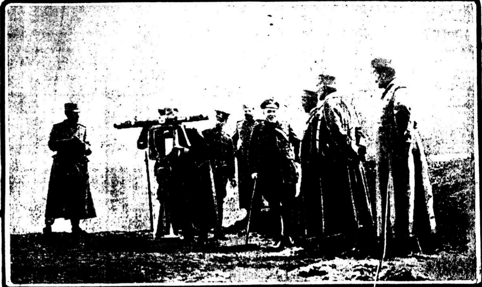
Crown Prince Alexander of Serbia conferring with Admiral Troubridge over co-operative measures for defence against the Germans.