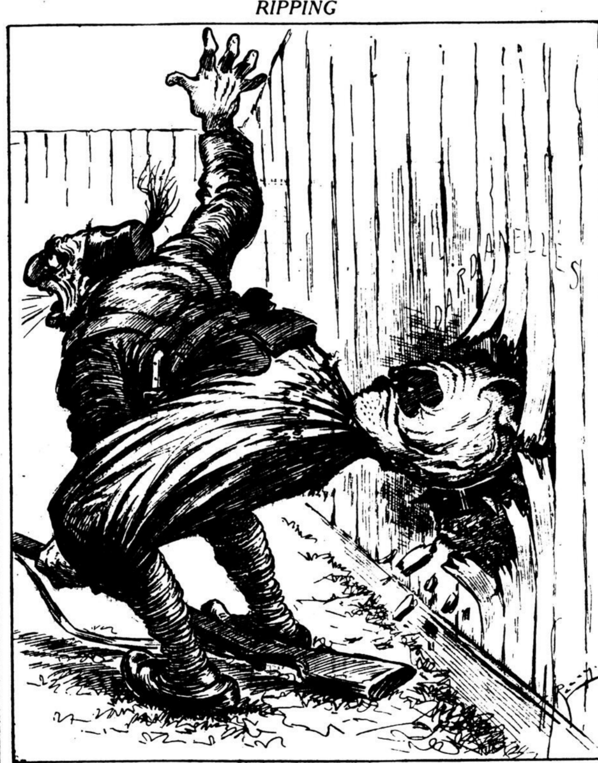
Turkey:—Will-i-a-m, help, help!

attached with bombs enemy trenches near Anafarta inflicting losses. "Near Arburu our artillery on the right wing destroyed enemy trenches, part of his fortifications and two observation posts and sank two sailing vessels laden with mining timber. "Tuesday, near Seddul Bahr, we destroyed an enemy patrol consisting of one officer and nine men. Our artillery silenced an enemy battery and forced the retreat of a torpedo boat which approached Hisarlik Burnu. "Both Shakespeare and Cervantes died on April 23, 1616, yet ten days actually intervened between the two deaths. The explanation is that then England was still using the Julian calendar.