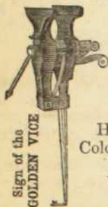
Sign of the GOLDEN VICE