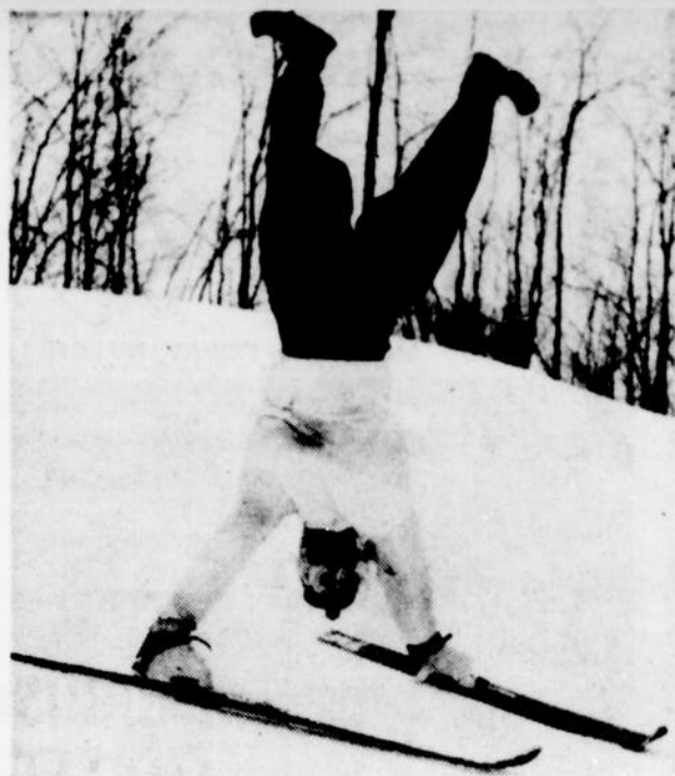
UPSIDE down skiing at the Cardy-Alpine-Chalet Cochand slopes in the Laurentians.

That's all children! The Spring skiing is very good!