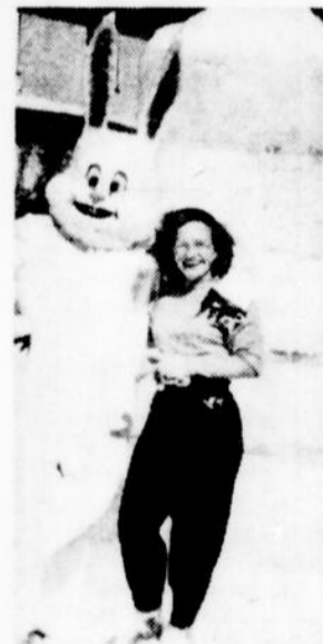
HARVEY, the inimitable rabbit, and guest at the Chalet Cochand, Ste. Marguerite.