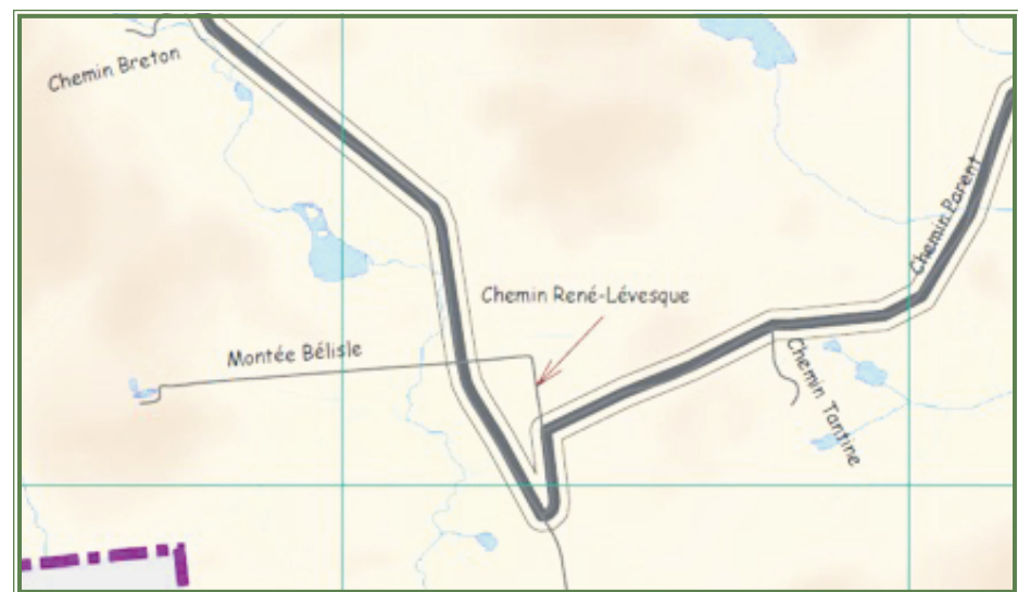
Extract of the road map with the correct layout for Chemin René-Lévesque

The Municipality apologizes for any inconvenience that this error could have caused.