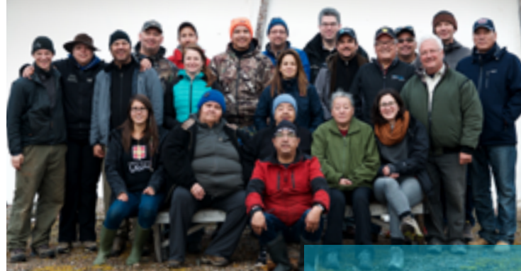
▼ Participants in the Refaire le Nord event organized by Corporation Mushuau-nipi at George River