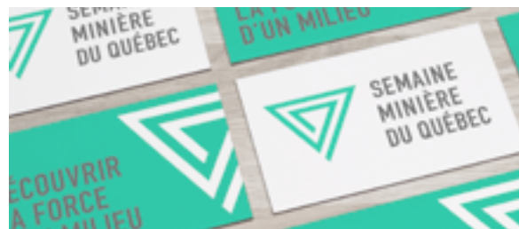
▲ View of the new logo of the Québec Mining Week

« Découvrir la force d'un milieu », a new teaser, was adopted thus obtaining a better uniformity in communications. It refers to the importance of the benefits and positive impacts generated by the mining activities in Quebec and its regions and the activities for discovering the mining sector held throughout Québec during Mining Week.