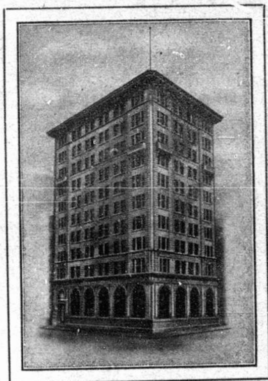
Bank of Toronto Building Cor. St. James and McGill Street