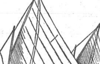
JAPANESE THEATRES. Patrons Enjoy Themselves, but are Compelled to Sit on the Floor.

To a stranger one of the most curious sights in Japan is a house of public entertainment. A more extraordinary or interesting sight is a house of public entertainment in which the entertainers are women.