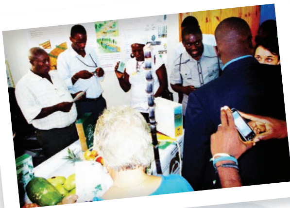
PRESENTING THE PROGRAMME DE RELANCE AGRICOLE ET DE LA NUTRITION (PRAN), HAITI