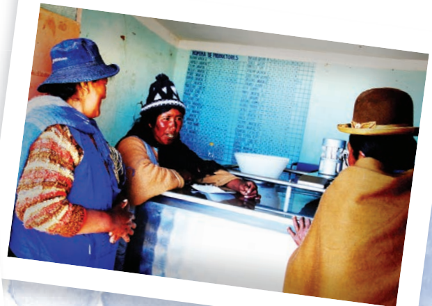
MILK PRODUCERS EL ALTO, BOLIVIA