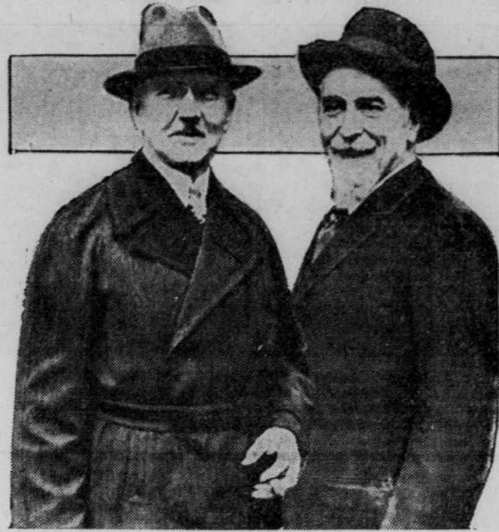
Dr. Schacht, president of the Reichsbank, recently arrived in London, after his return from Washington where he joined President Roosevelt in the economic conference, on his way home to Germany.