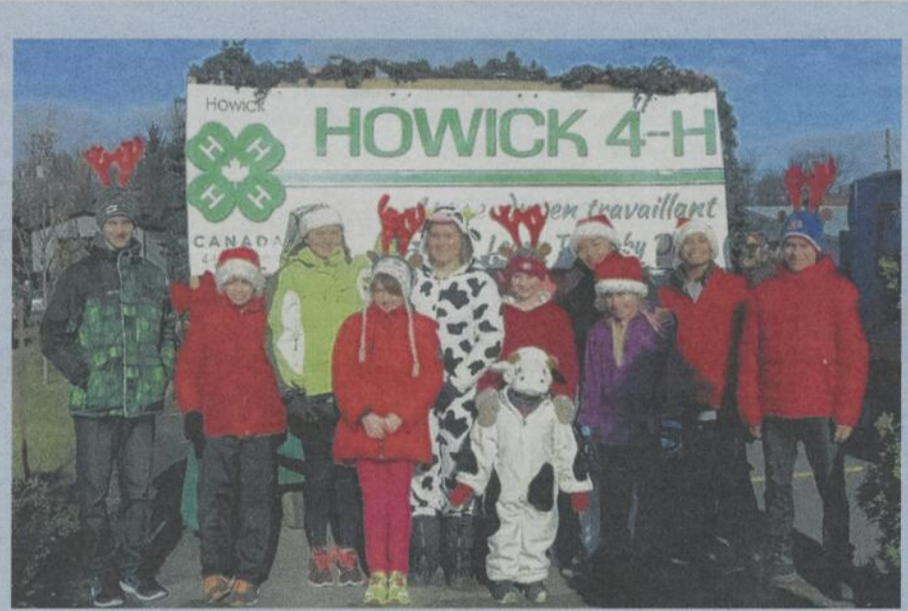
The Howick 4-H club pose in front of their Christmas parade float.