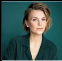
VÉRONIQUE CLAVEAU Céline Dion