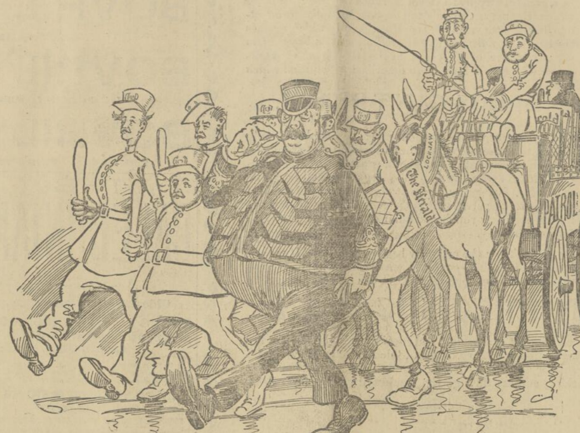
THE CHIEF'S VENGEANCE.