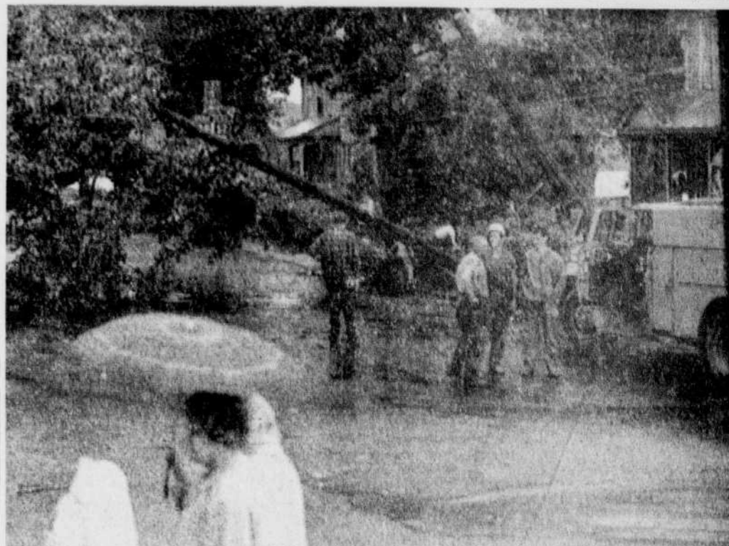
STORM DAMAGE — Waterloo was still cleaning up today after Friday's fierce storm when uprooted trees blocked off many street, power lines were cut and the roof of a plant was torn off. Foster Square, seen here, was blocked off from traffic for more than an hour.

"If a single act of folly was more responsible for this explosion than any other," Johnson said, "it was the arbitrary and dangerous announced decision that the Straits of Tiran would be closed."