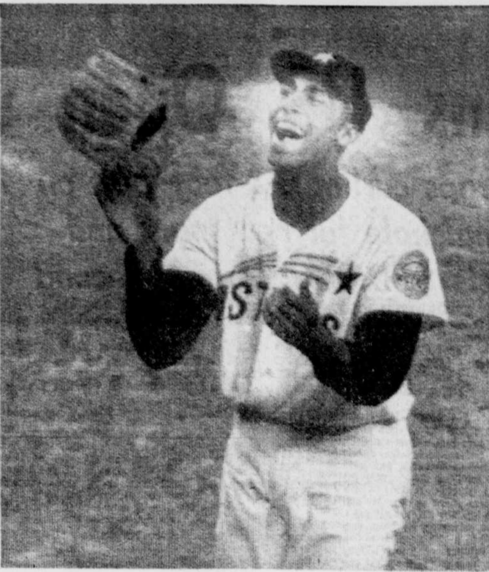
WILSON EXPRESSES JOY—Don Wilson, 22 year old pitcher for the Houston Astros, shows his big smile and tosses his glove high into the air as he comes off the pitcher's mound in the ninth inning of Sunday's game. Wilson had just pitched the first no-hit no-run game in the National League this year as Houston beat Atlanta 2-0. Wilson now has a 4-3 record as he struck out 16 Braves yesterday.