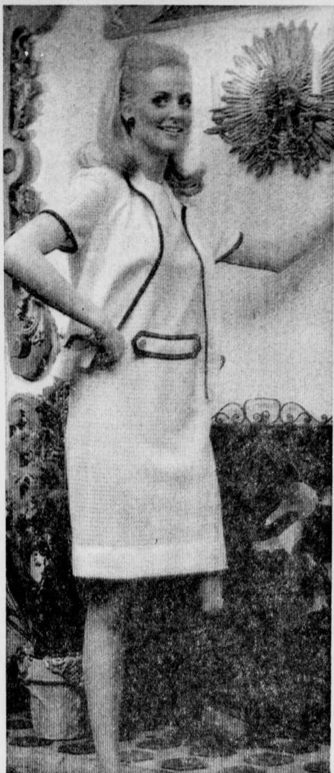
JACKET DRESS — R. and K.'s jacket dress is of arnel cross-dyed honeycomb knit. The short jacket has binding to match the front half belt.