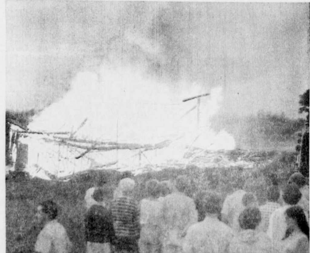
FIRE DESTROYS BARN — Warden was struck by a bolt of lightning and immediately caught fire. No animals were in the barn at the time.

A lightning bolt is said to have hit a barn owned by the Hauser brothers near Warden, burning it to the ground. There was no livestock in the barn at the time.