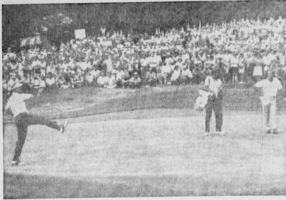
ANOTHER RECORD FOR NICKLAUS — Jack Nicklaus kicks leg after sinking birdie putt on 18th hole to win the 67th US Open Golf Championship.