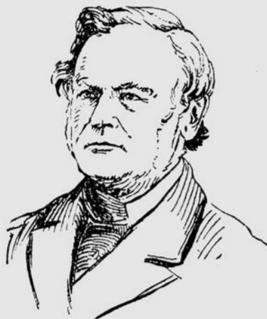
THE LATE SIR LEONARD TILLEY.