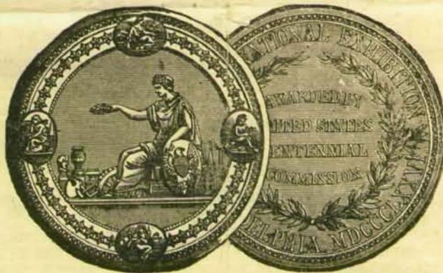
The Centenary Medal, 1876.