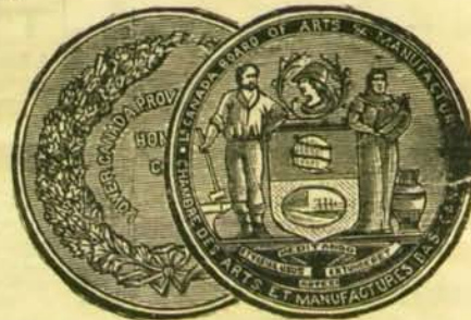
A Diploma for the best Domestic Havana Cigars was awarded at Canadian Exhibition 1880 to