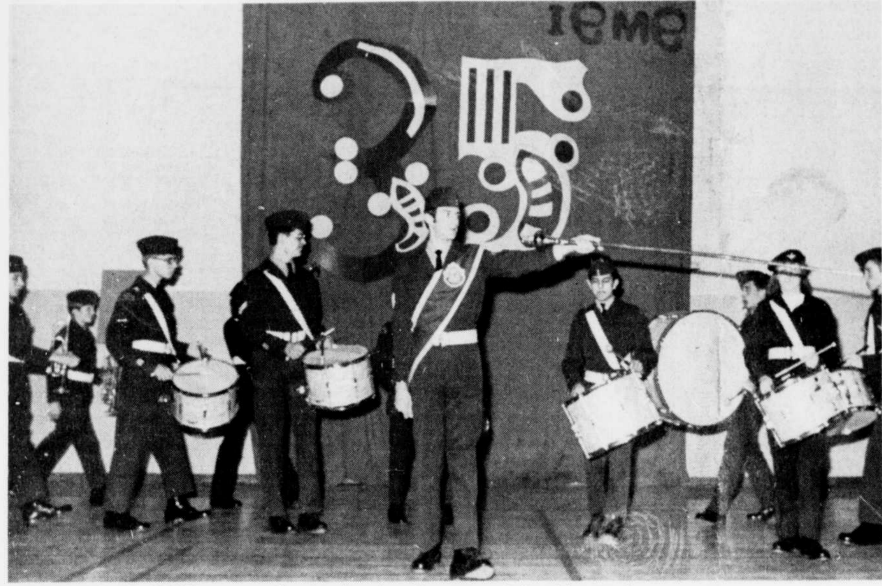
SHERBROOKE AIR CADETS are currently celebrating their 35th anniversary. The above air cadet band put on a lively display of musical virtuosity and march manoeuvres Friday night at the Belvedere St. Armory, Sherbrooke Air Cadets are one of the oldest Cadet regiments in Canada.

The 240 delegates to the meeting seemed as much preoccupied with the threat of Quebec separation as with the popularity of the federal Liberal party which, recent polls indicate, has fallen to an all-time low. At a news conference Saturday, Mr. Ouellet refused to distinguish between the fate of his party and the future of the country, saying that the Liberal party has been the main force for unity in Canada.