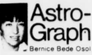
Bernice Bede Osol