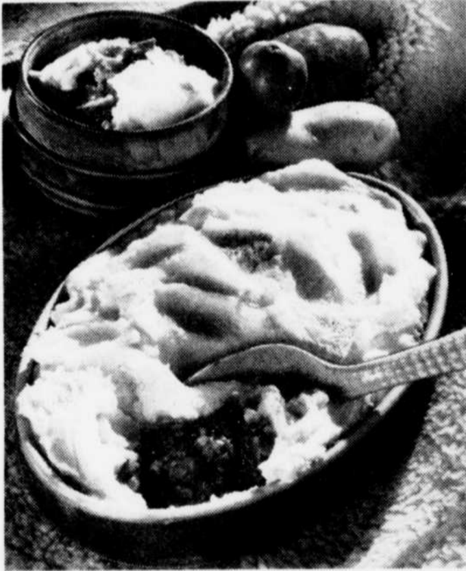
TOP HASH with creamy mashed potatoes and some Parmesan cheese.

Saute onion and celery in butter until tender. Stir in meat and oregano. Season to taste. Heat through. Pour mixture into buttered shallow 2 quart casserole. Spoon mashed potatoes over hash.