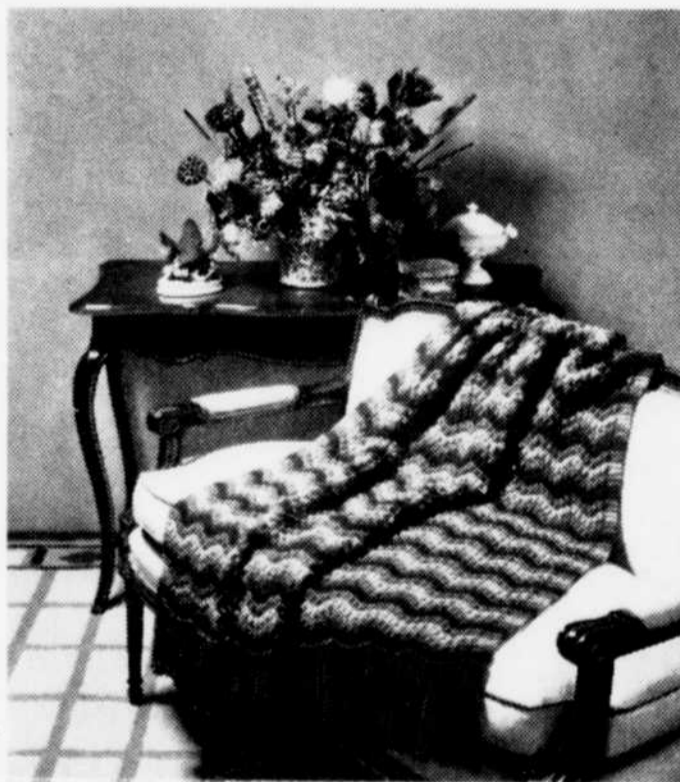
POPCORN ripple pattern gives this afghan a handsome texture design. Most effective when knitted in three colors.

The afghan is knitted in three colors. You'll get a soft, subtle look if all are variations on a single color theme. Or, if you like the dramatic, mix harmonizing shades from three separate color families.