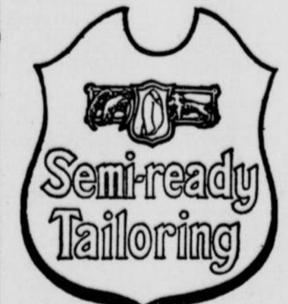
The Sign in the Pocket of a Semi-ready Suit.

The proof of Quality. The mark of Smartness. The label of Value. The guarantee of Fit and Wear.