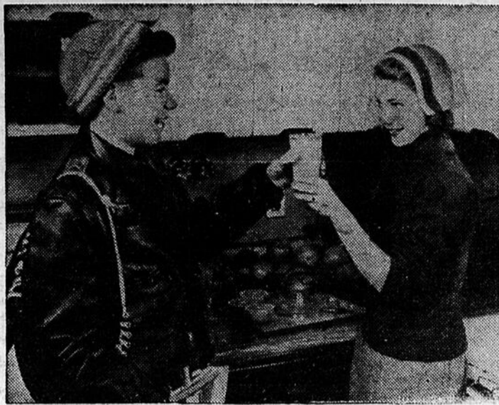
WINTER COLDS TAKE A BEATING when youngsters are fortified with juices. These youngsters have theirs after school.

One of the safest and sanest things that everyone can do every day to keep the system toned for colder, changeable weather, and to prevent winter colds is to get an adequate amount of vitamin C daily.