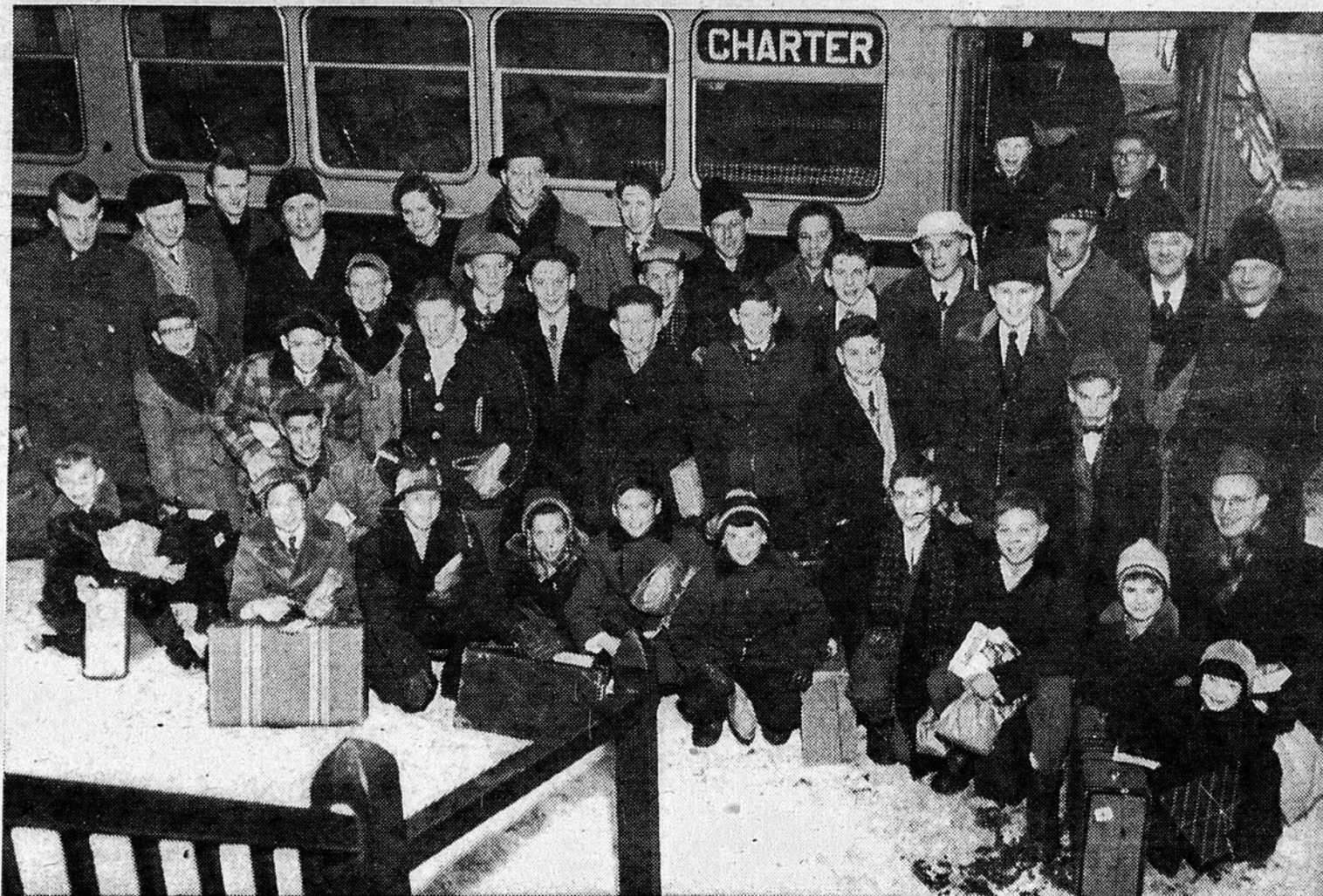
CHURCH CHOIR ON TOUR: A group of singers from the Church of the Advent took a short trip this week and travelled north to sing. Included in the group were 32 boys and 10 men.