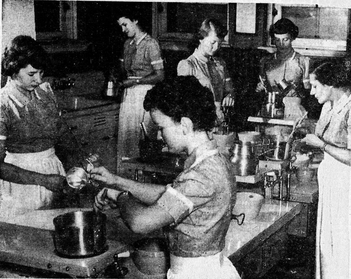
DIETETIC LABORATORY, of the Queen Elizabeth Hospital showing the training of student nurses in the kitchen.