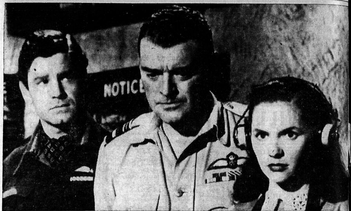
Anthony Steel, Jack Hawkins and Muriel Pavlow in a scene from "The Malta Story" which is now in its second week at the Avenue Theatre. The story is thrilling screen