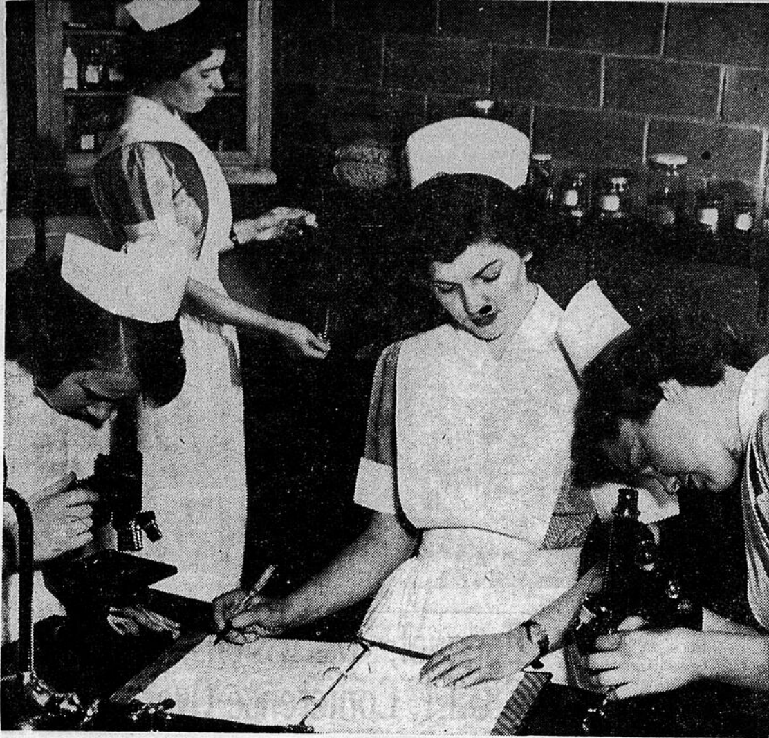
MICROBIOLOGY LABORATORY: of the Queen Elizabeth Hospital where student nurses are shown during study period.