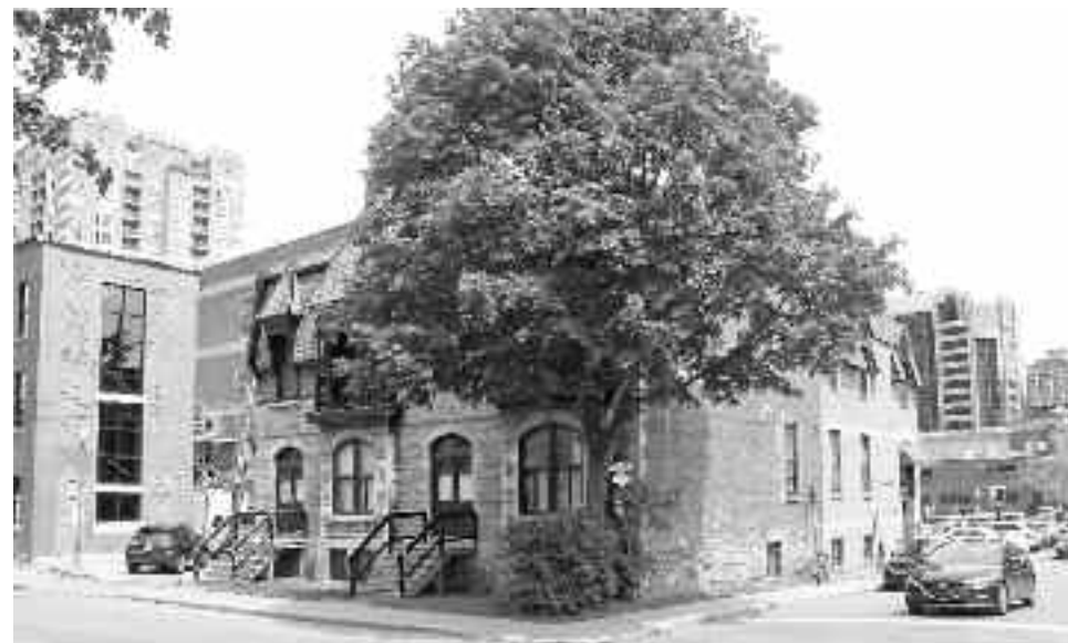
11-15 Gladstone Ave., June 17.