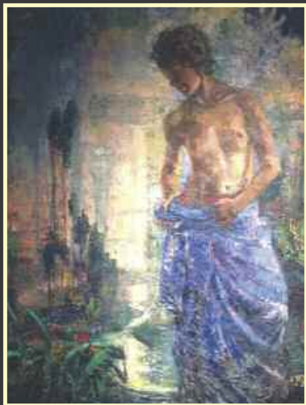
Tom Hopkins La source, 60 x 54 - Oil on canvas, 2001