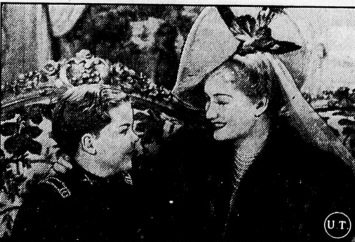
Miriam Hopkins, brilliant dramatic star in a scene from "Lady With Red Hair," which will be at the Westmount United Theatre Sunday for three days until Tuesday.