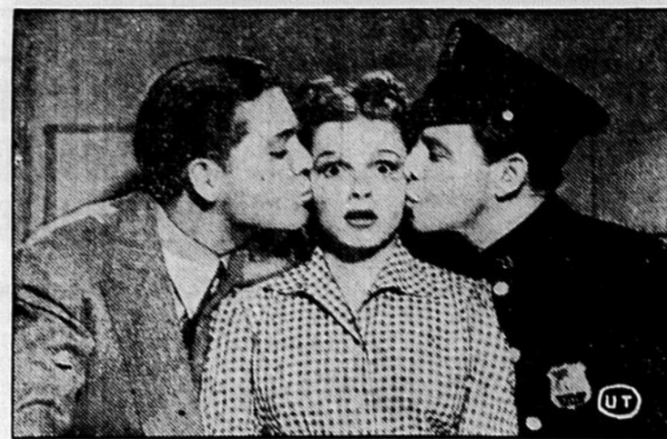
Douglas McPhail, Judy Garland and George Murphy in a scene from "Little Nellie Kelly," George M. Cohan's Broadway stage hit, which opens at the Monkland United Theatre on Sunday running for three days until Tuesday.