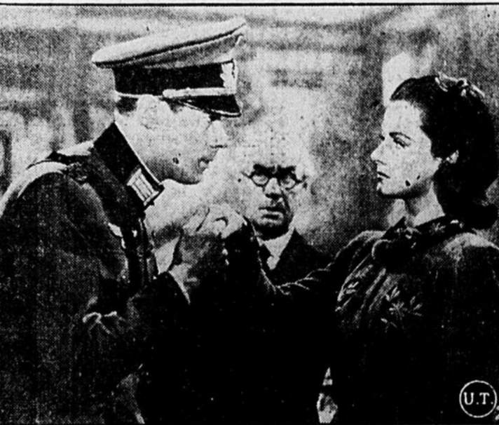
Rex Harrison and Margaret Lockwood offer plenty of thrills in the exciting spy drama "The Night Train to Munich," which will be at the Snowdon United Theatre commencing on Sunday afternoon.