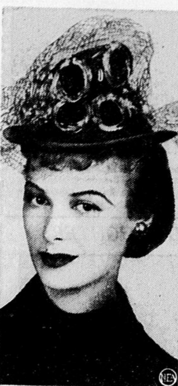
Atop an utterly lovely coiffure with soft bangs at the front and a low chignon at the back is this smart little navy straw position—worn tilted on the top of the head. The brim is faced with red. The cloud of veiling is navy blue. The shining rings which trim the crown are loosely rolled circles of silvery vinylite.