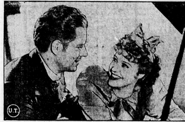
Noel Coward's musical hit, "Bitter Sweet," comes to the York United Theatre on Saturday playing until Tuesday night, with Nelson Eddy and Jeanette MacDonald as its singing stars. The pair are reunited for the seventh time in this song-studded picturization of life in London and Vienna during the Gay Nineties.