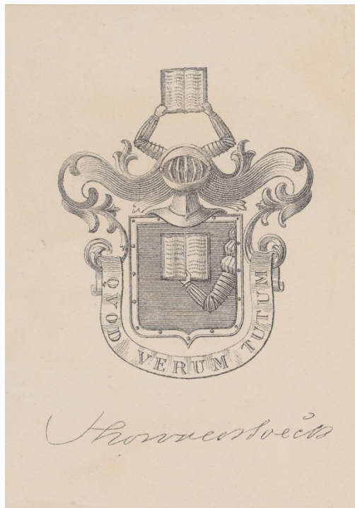
Figure 2: Boeck's ex libris .

this tells us that Boeck respected these rough artefacts of the printer's trade, and that he wanted to take good care of them.