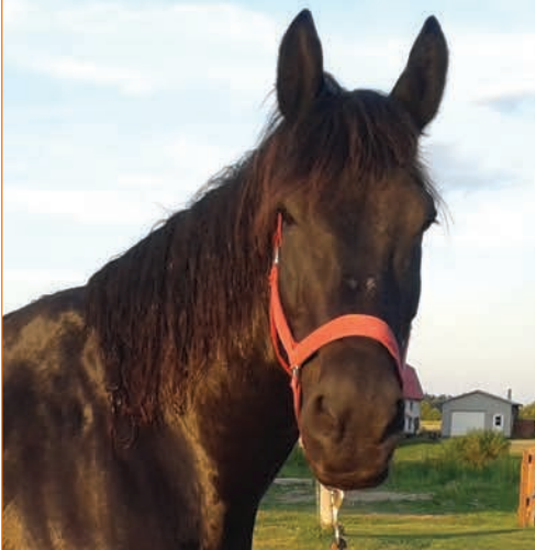
Black Jack is one of the two carriage horses rescued by Montreal's SPCA in October 2012.

O ur inspectors respond to complaints of animal cruelty and neglect. They also check the places where animals are kept for sale, lease or exhibition. In 2012, they investigated 1,387 complaints and conducted the inspection of 4,645 animals , all species combined. They removed over 100 animals as a result of their investigations and many criminal charges were laid.