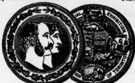
2 Gold Medals, Toronto, 1888-89.