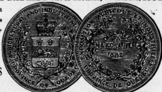
The only Prize Medal, Montreal, 1882.

5 Gold Medals, 5 Silver Medals, 2 Bronze Medals, awarded to