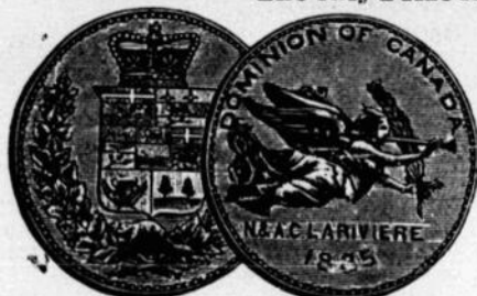
Gold Medal, London, 1885.