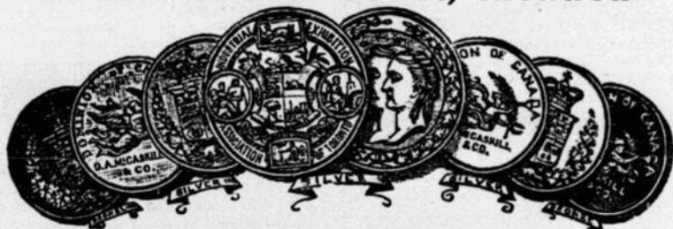
1 Gold, 2 Silver and 2 Bronze Medals, Ottawa, 1879.