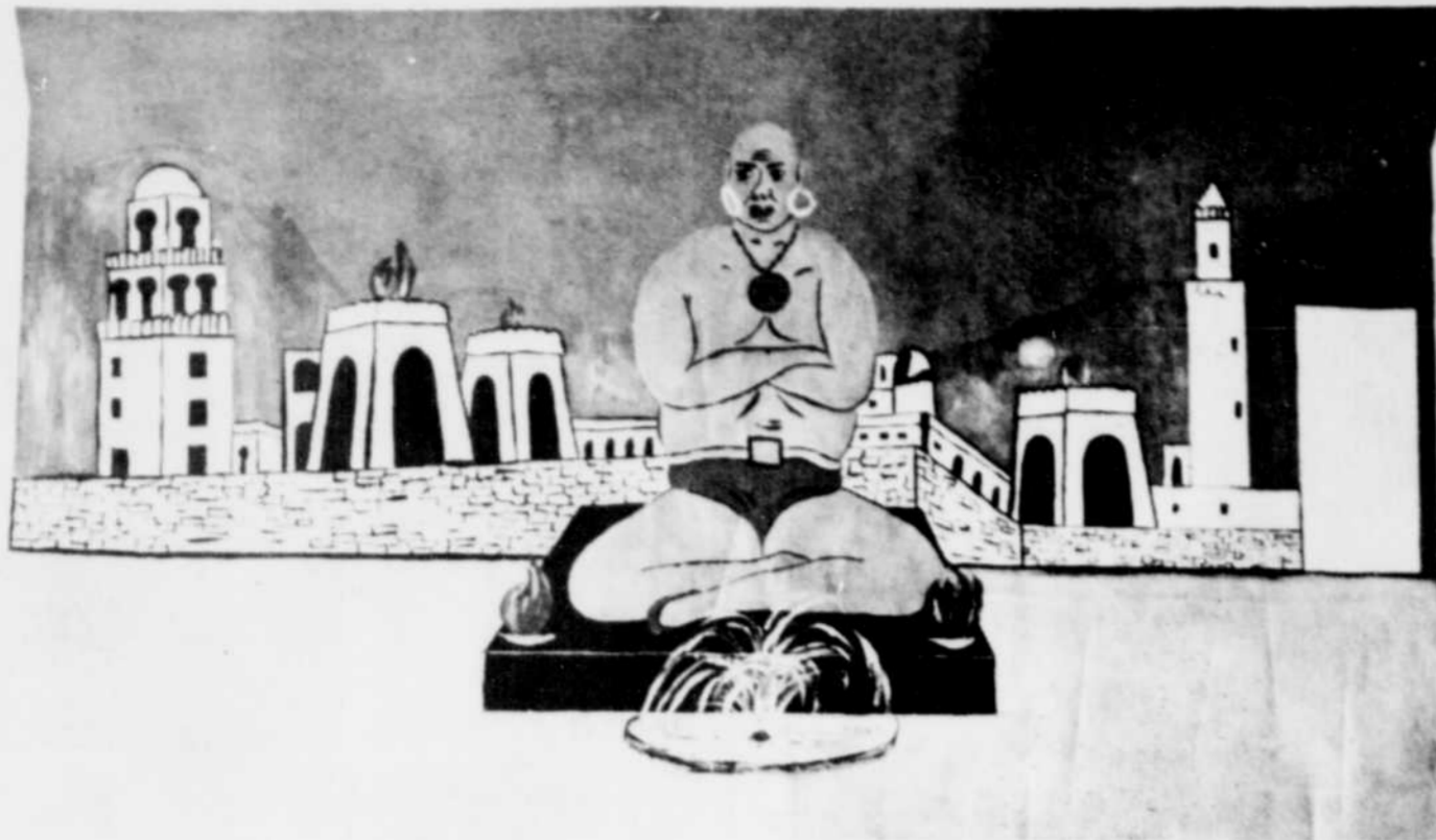
MAGOG SHOW BACKGROUND — The huge 40 foot background being used in this Sunday's Policemen and Firemen's Festival at Magog's arena, shown above is both impressive and colorful. Built in sections, the setting will set