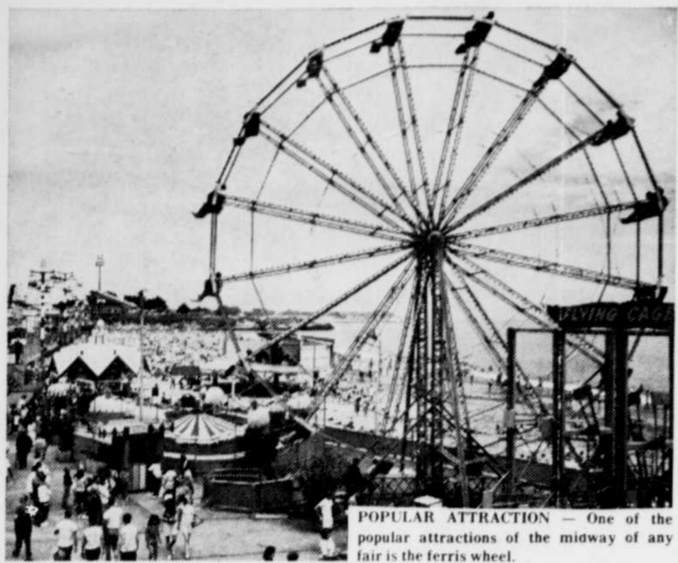
POPULAR ATTRACTION — One of the popular attractions of the midway of any fair is the ferris wheel.