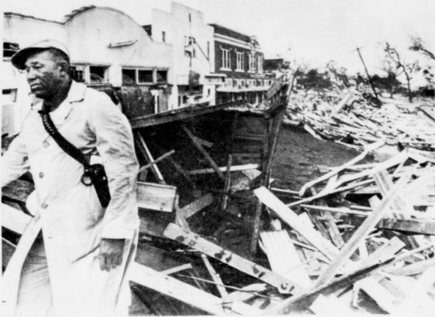
BUSINESS SECTION IN SHAMBLES — A local police official stands guard in the downtown section of Pass Christian, Miss., as the main street is covered with wreckage from business and beach homes as hurricane Camille lashed the

TODAY'S CHUCKLE — College football is fast becoming a game in which you need a degree to get a ticket.