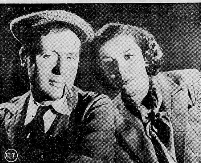
Robert Montgomery and Rosalind Russell in a scene from "Night Must Fall," now at the Seville until Saturday, and opening on Sunday for three days at the Monkland.