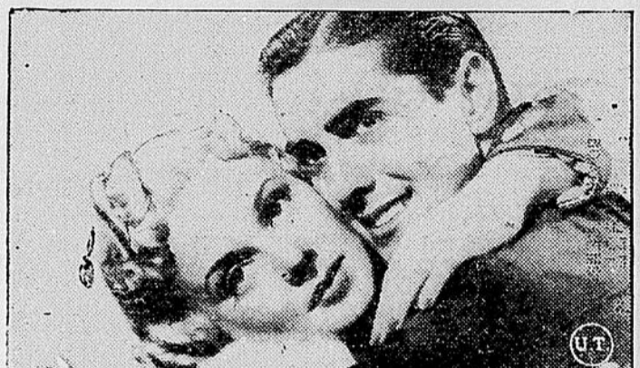
Beautiful Sonja Henie and Tyrone Power as they appear in the delightful musical romance "Thin Ice," now at the Westmount until Saturday, opening a three day engagement at the Seville on Sunday.