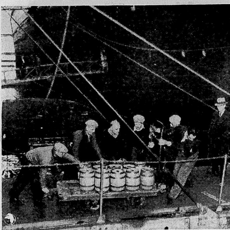
Those little barrels which look like kegs of nails are really kegs of gold—$10,250,000 worth being loaded on the S.S. Normandie, which may be seen in the background, and is the first gold to be shipped out of the U.S. in years. That stern gentleman at the right is a treasury agent and he doesn't have his hands in his pockets just to keep them warm. The gold is being shipped to France.