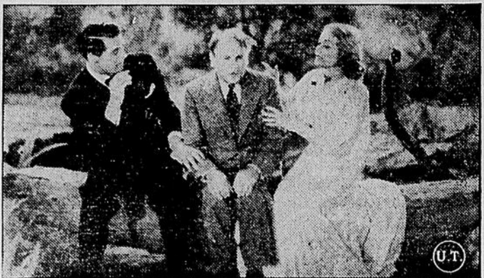
Cary Grant, Roland Young and Constance Bennett in a scene from "Topper," written by Thorne Smith and the author of "My Man Godfrey," which will be featured at the Westmount on Sunday for the first three days of the week. This feature will follow directly at the Seville, Monkland and Snowdon.