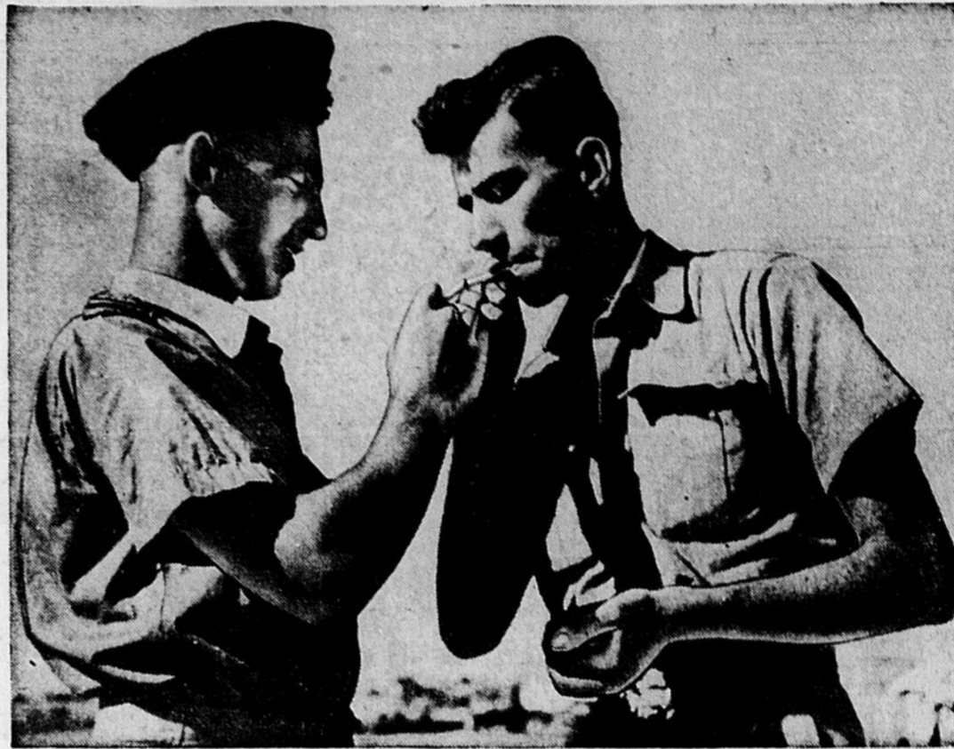
These two Canadian airmen among the fighting fliers of the United Nations who helped light the fuse that exploded Hitler's pipe-dream. They were part of a bomber crew which flew with the air forces, keeping Rommel's Afrika Korps in frantic retreat. Advance Canadian personnel have arrived in North Africa for special training. The National Film Board's latest film in the CANADA CARRIES ON series, "PINCERS ON AXIS EUROPE," gives a full report of the North Africa operation, from the landing of the vast United Nations force to the race across the desert after Rommel's fleeing army. Importance of the move to the United Nations offensive, in its relationship to the struggle on the Russian front is dramatically presented.