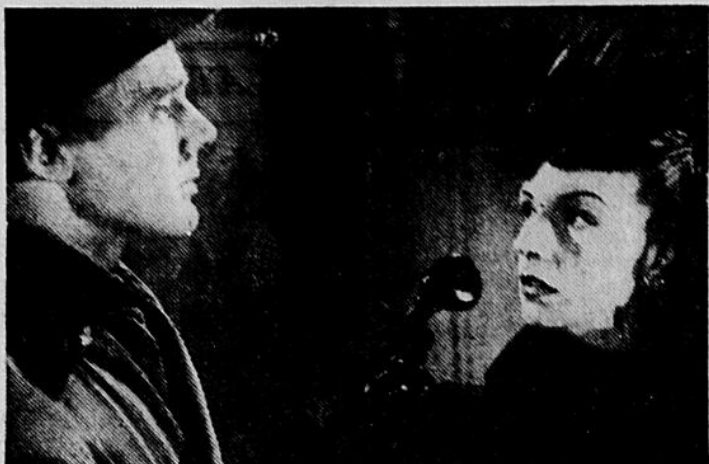
Van Johnson and Faye Emerson in a scene from "Murder in the Big House," which opens at the York United Theatre on Saturday playing until Tuesday night.