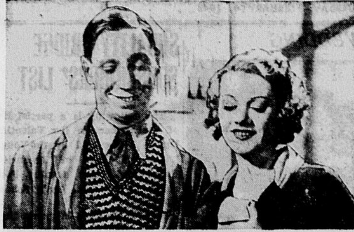
George Formby and player in a scene from "Much Too Shy," which opens at the Westmount United Theatre on Sunday playing until Tuesday night.