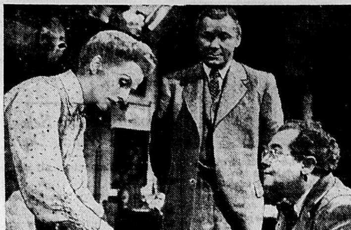
Doris Dudley, Herbert Marshall and Steve Geray in a scene from "The Moon and Sixpence," which opens at the Monkland United Theatre on Sunday playing until Tuesday night.