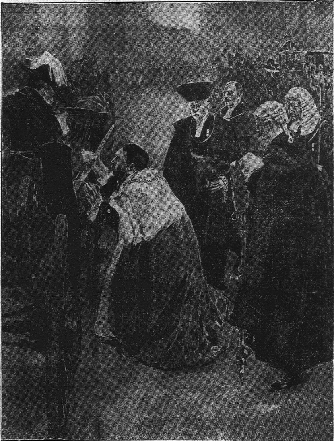
THE THANKSGIVING FOR PEACE—THE KING RECEIVING THE CITY'S HOMAGE ON HIS WAY TO ST. PAUL'S CATHEDRAL.