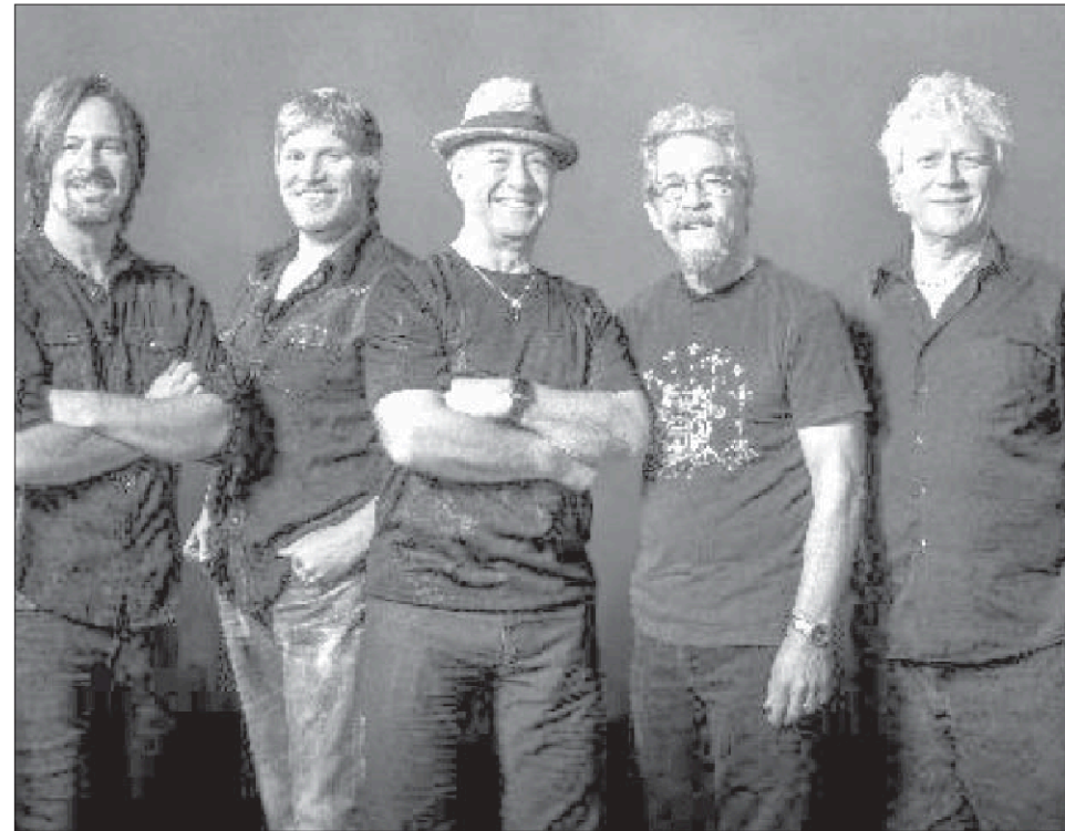
Creedence Clearwater Revisited will headline the Fête du Lac des Nations, Saturday, July 20.

Access is always free for kids 12 and under