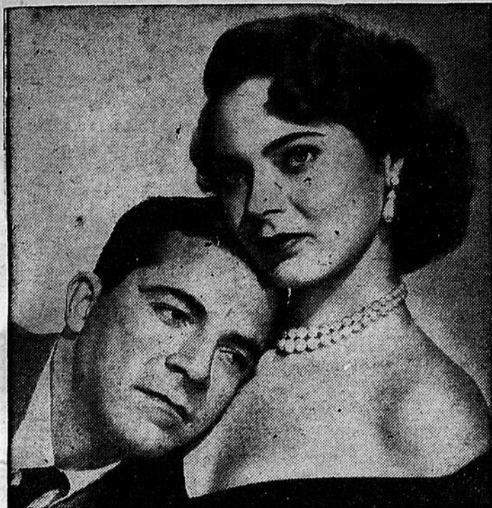
"Assignment — Paris," starring Dana Andrews and Marta Toren. This action packed drama commences Saturday at the Monkland Theatre.