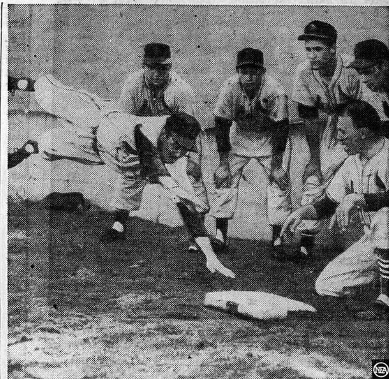
RED BIRD IN FLIGHT —Pitcher Stu Miller flies through the air like he means business during base-sliding exercises under the eye of Manager Eddie Stanky, kneeling, who explains the fundamentals to his rookie hurlers at the St. Louis Cardinals' St. Petersburg, Fla., training camp.