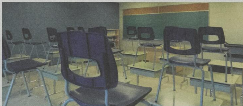
A reduction in school taxes expected for next year.