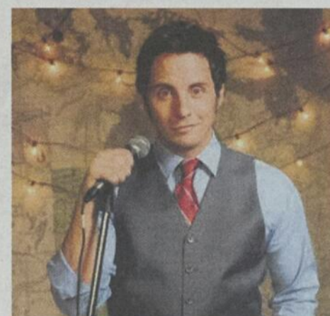
The host Jonny Harris.