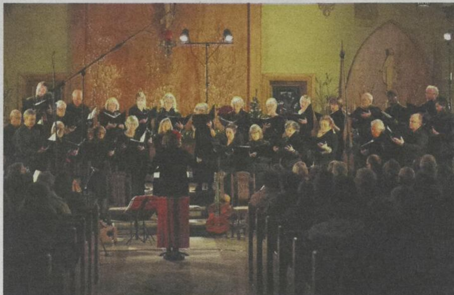
The Avalon Singers.

The Mystery of Bethlehem, a cantata in six sections by the British/Canadian composer