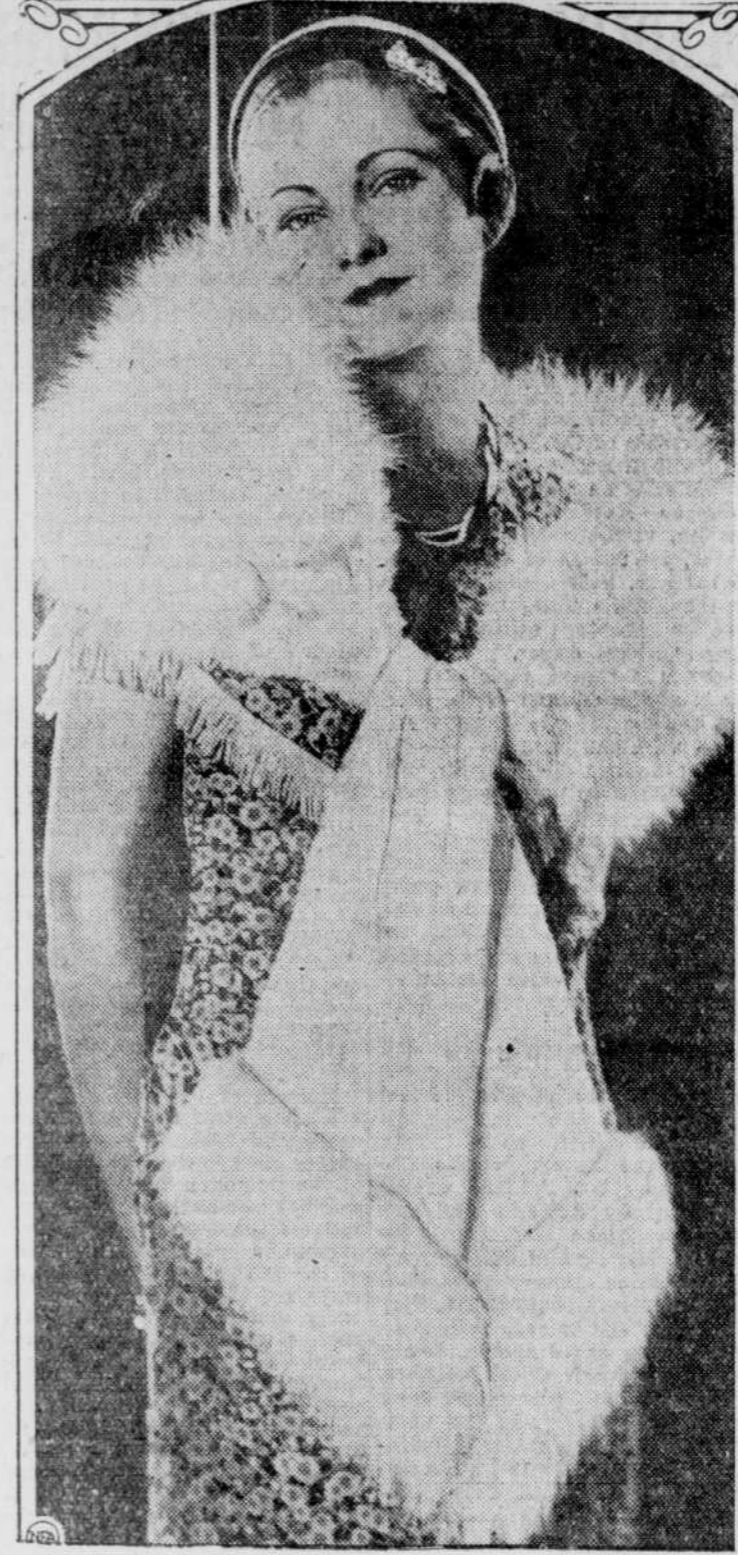
White Fox Styles Chic Scarf.

The white fox scarf, cut of regal fur, tied in Ascot manner, is the latest luxury fashion furnishes the smart woman. For cool summer evenings or late afternoon at beach or in the mountains, the new fox scarfs give just the right amount of warmth, plus great chic. They are cut on ample proportions, tailored to fit the shoulders and tie with ends of summer ermine, bordered in the white fox.