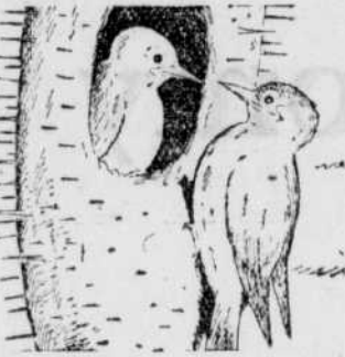
"It is a perfect home," said Cactus Bill

Now, of course, Cactus Bill didn't understand a word of this. If he had he undoubtedly would have chuckled. Also, he would have pitied Farmer Brown's Boy for his ignorance. He and Mrs. Cactus Bill were going to have the most perfect home in all the Great World.