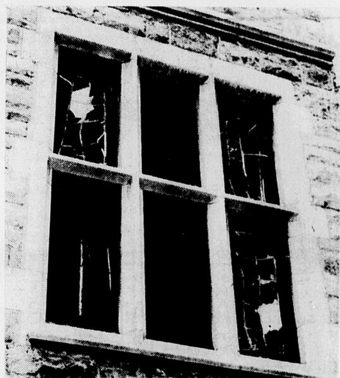
CITY HALL WINDOW: The remains of a Westmount City Hall window indicates the force of a bomb that exploded there early Wednesday morning. The shock waves from the blast were so strong, windows in buildings up to 140 yards away were broken. Other than broken windows, the City Hall itself suffered no damage.

Criminal activity in the city showed an overall drop. While burglaries and attempted burglaries totalled 134, an increase of 13 over 1963, the incidence of all other types of crimes decreased to 327 maintaining a steady reduction from 496 in 1961. The value of stolen property was slightly higher than last year at $297,000.