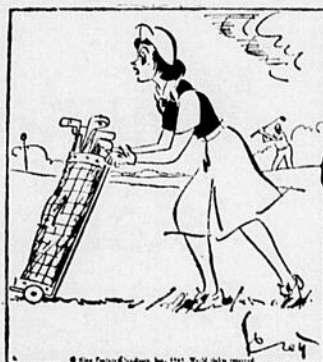
"Now I know why he asked me to walk around the course with him."