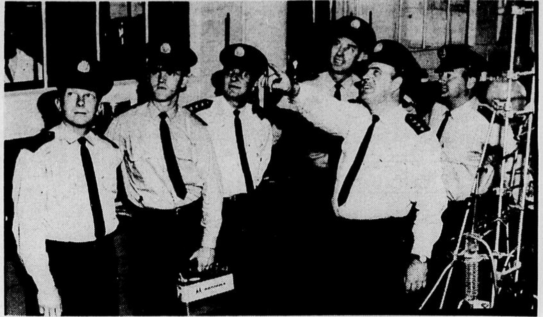
INSPECTING: Westmount firemen are seen inspecting the new Charles Fraust building in Westmount. Firemen make it a point to inspect every new building so that if fire should strike they know what the building is like inside, how