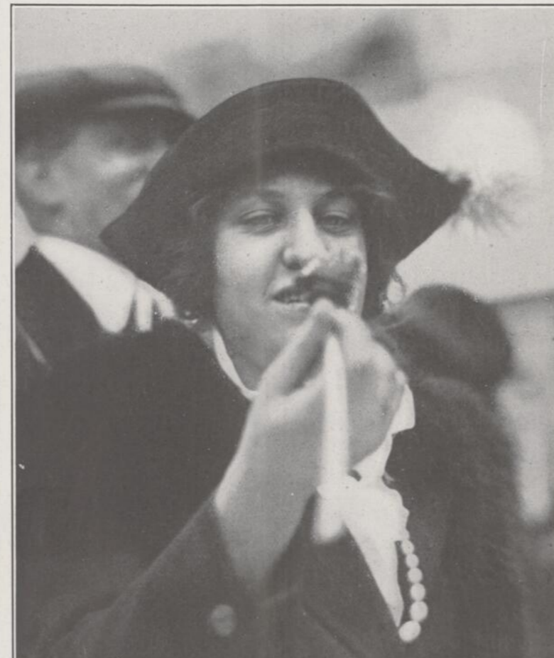
A DAY IN AN EASTERN TOWNSHIPS' SUGAR-BUSH —A sweet morsel—the manner in which maple sugar "wax" is eaten after it solidifies on the snow.

The whole world is awakening to Canada's Practical Monopoly of the World's Richest Furs—THE