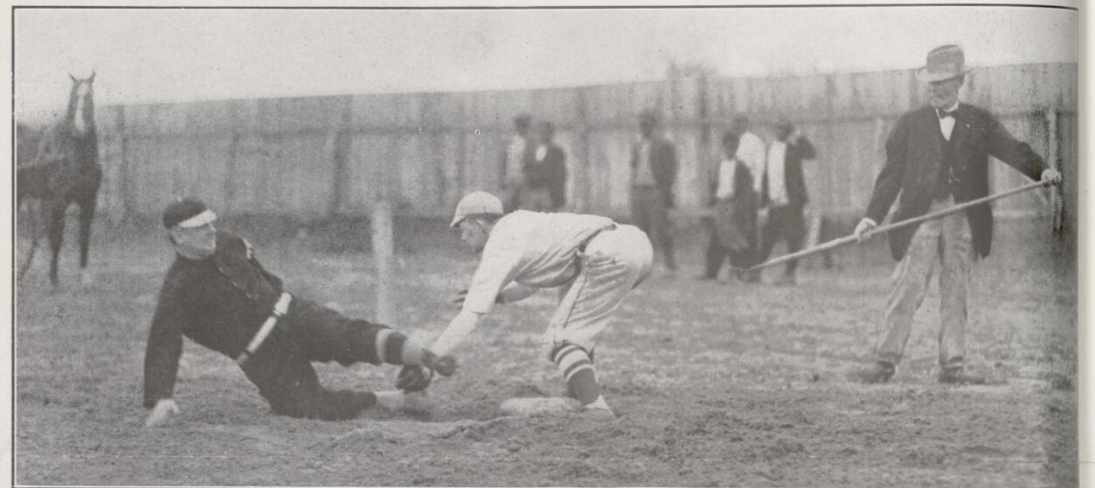
TEACHING THE YOUNG IDEA HOW TO SLIDE—Here we have a realistic picture from the Southern training camp of the New York National Baseball Team. The figure in the dark uniform is "Mugsy" McGraw, famous manager of the team, who is here demonstrating to one of his recruits how to slide into the bag. Beside him is the groundkeeper with the rake who goes over the "sliding pit" after every slide and smoothes it out. A few of the colored population of the South are in the background.