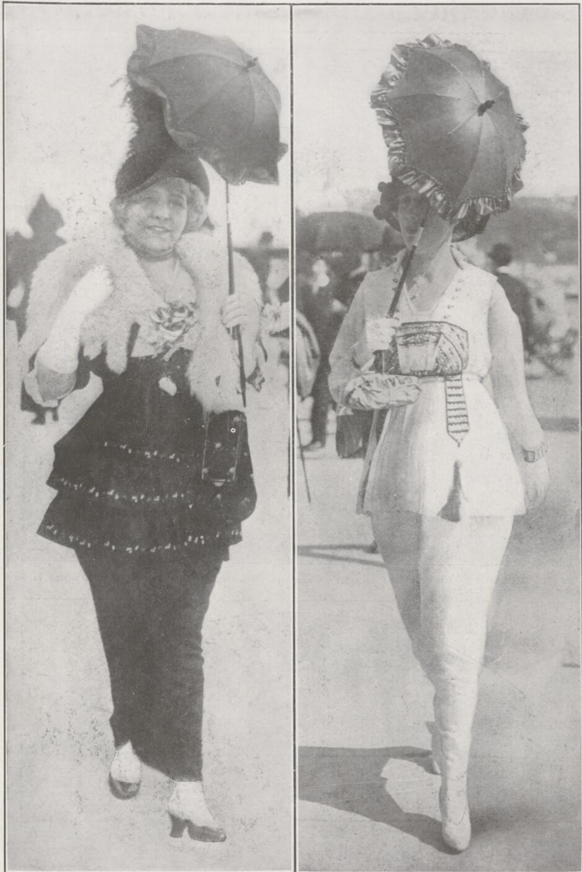
IN THE WORLD OF FASHION—The very latest styles in spring costumes as seen on the promenade at Monte Carlo. Note the new type of parasol.