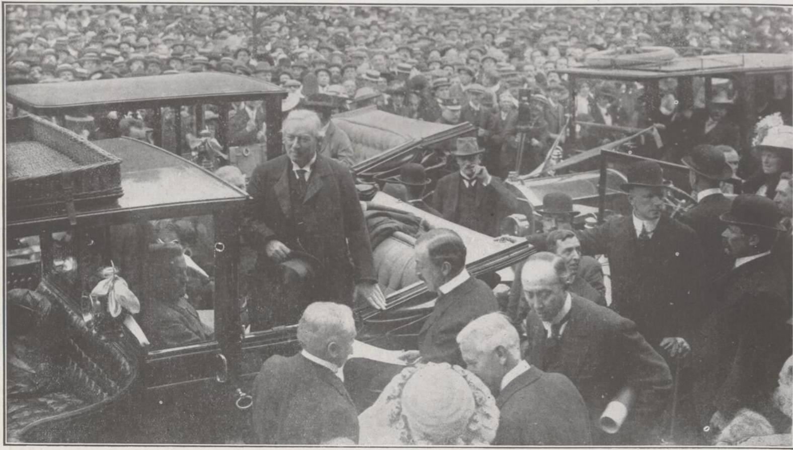
BRITISH PRIME MINISTER WHO WAS RETURNED UNOPPOSED FOR EAST FIFESHIRE LAST WEEK—Mr. Asquith's dramatic and unexpected resignation of his seat in the British House of Commons on March 30, following his assumption of the portfolio of Secretary of State for War, had its sequence last week, when he was again returned to Parliament by his old constituency of East Fifehire Scotland. An interesting coincidence in connection with Mr. Asquith's re-election is that it occurred on the sixth anniversary of his assumption of the office of Prime Minister. The cabinet change which induced Mr. Asquith to assume the portfolio of Secretary for War was brought about by the resignation of Col. John Seeley, in consequence of the crisis in the army resulting from the resignation of a large number of officers, who thought they would be forced to take up arms against Ulster. In the above picture Mr. Asquith is seen in the act of receiving an address from his constituents.