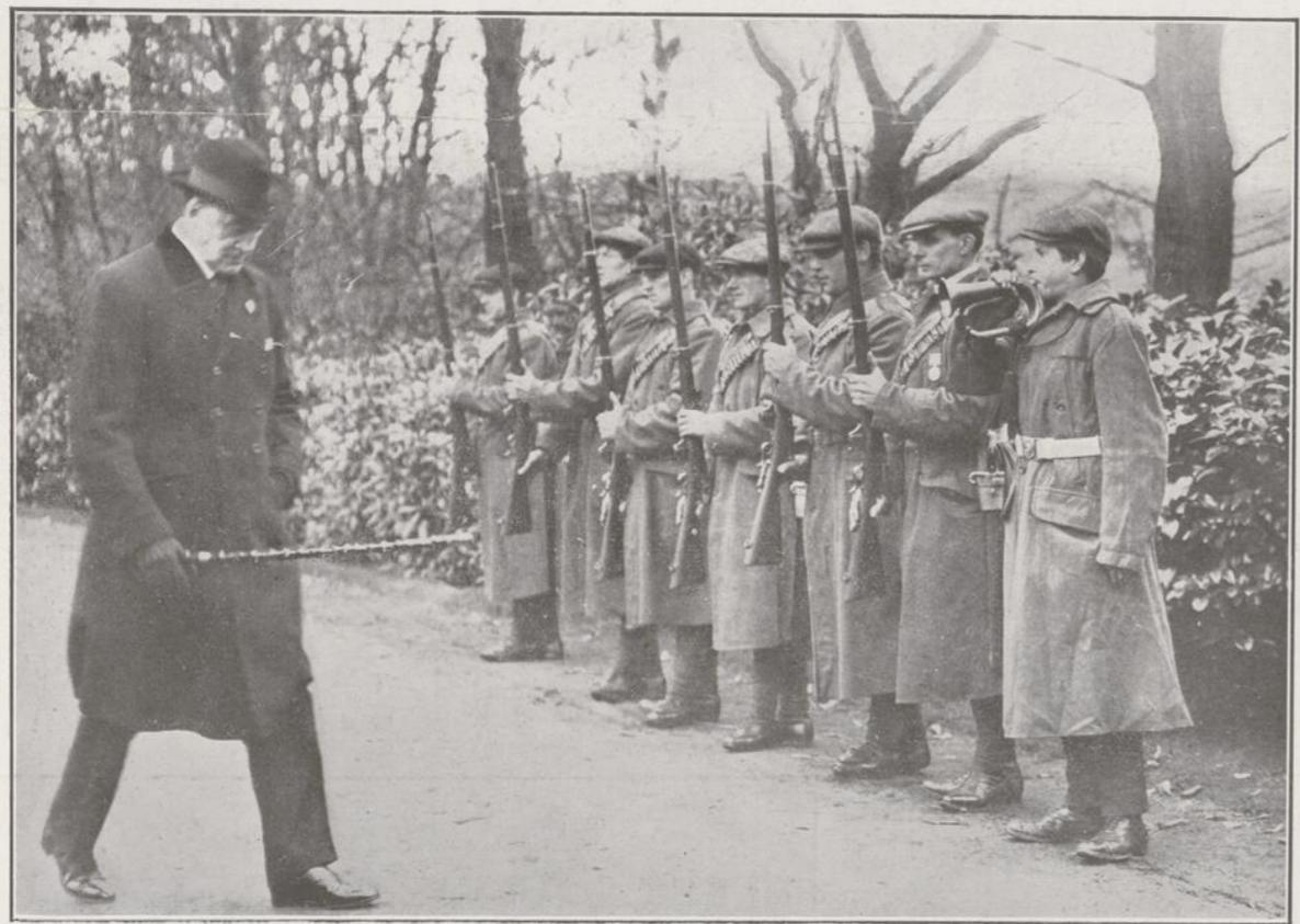
SALUTING THE LEADER—Guard at Craigavon, the Ulster headquarters, turning out to salute Sir Edward Carson.