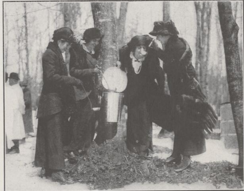
A DAY IN AN EASTERN TOWNSHIPS' SUGAR-BUSH —A bunch of city girls having a jolly time of it sampling sap as it flows from the tree.

settlers had kettles for the making of potash which in many districts was the only crop for which money could