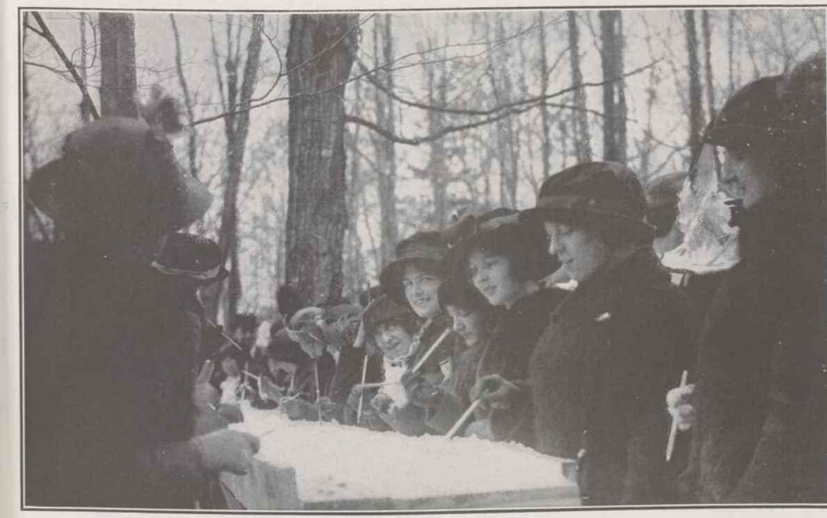
A DAY IN AN EASTERN TOWNSHIPS' SUGAR-BUSH —Sampling "wax" fresh from the boiling pot. "Wax" is maple syrup boiled down to the consistency of "taffy." It is poured on trays or tables of snow, where it cools and solidifies. It is then picked up on the end of a stick and eaten with an evident relish. In the above picture the "wax" is being sampled by many who had never seen such a thing before in their lives. The experience was, therefore, an unique one to them.

description of the visit see article in the letter-press section of this issue of the Standard.