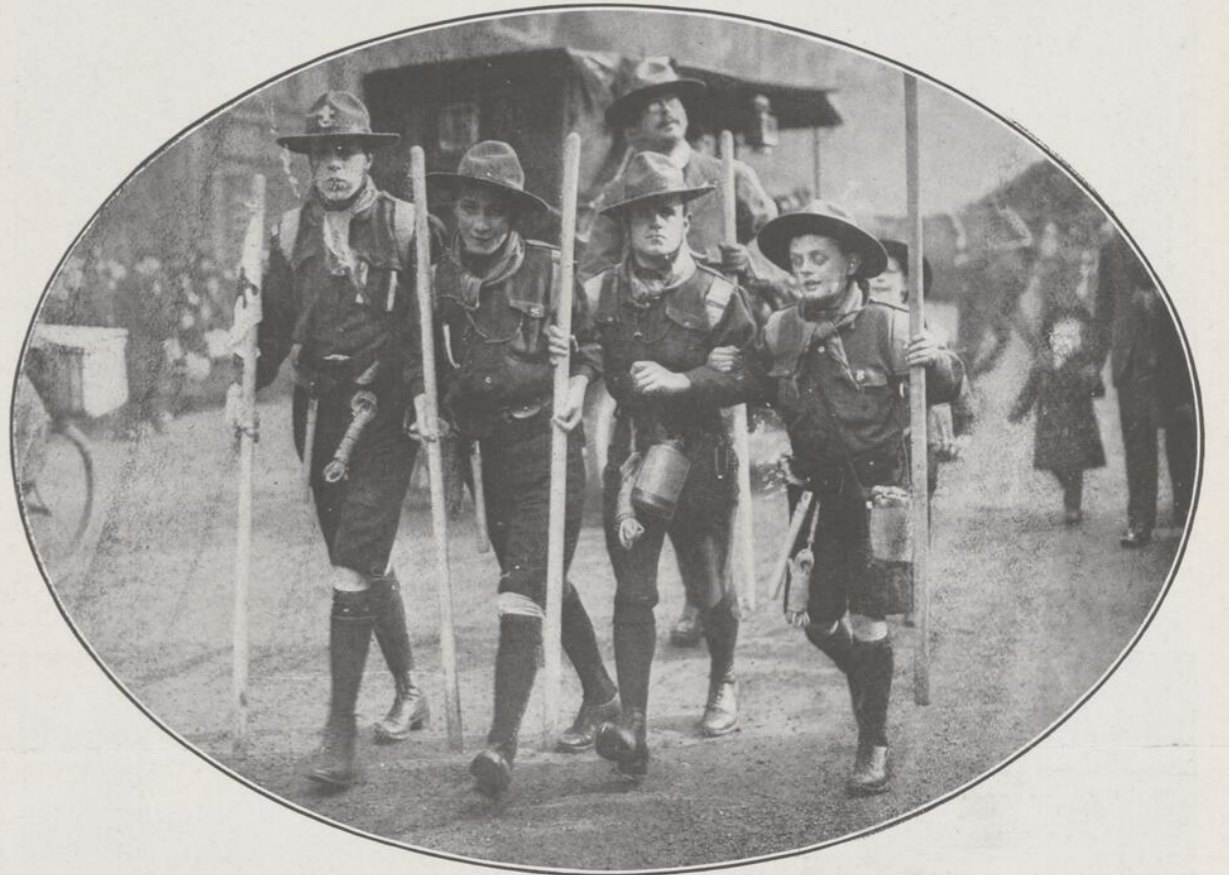
A SIGHTLESS GUARD OF HONOR FOR THE KING —On the occasion of the recent opening of the National Institute for the Blind in Great Portland Street, London, a detachment of blind Boy Scouts formed a guard of honor for His Majesty the King. When His Majesty saw them drawn up under Scoutmaster Brown he wondered how they were able to do so much. Chief Scout Sir R. Baden Powell informed him that one could milk cows, another could make butter, and a third make aeroplanes. They were also excellent Morse signallers, and were as clever as more fortunate boys in "tracking" an enemy, relying in their work on sounds. In the above picture three of the Scouts are being led to the Institute.

Several of the pictures on this page are illustrative of the maple sugar industry and are the reproductions of photographs recently taken by one of the Standard artists at one of the biggest sugar bushes in the Eastern Townships of the Province of Quebec. When the photographs were made a large party of Montrealers were in the "bush" for the purpose of witnessing the modern method of transforming sap into syrup and sugar. By way of contrast a quantity of sap was converted into syrup in an open kettle—the old-fashioned method. For a full