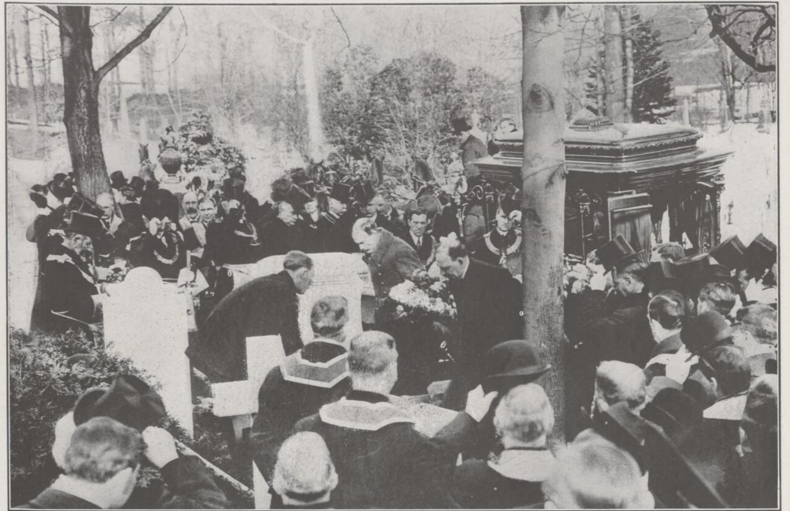
THE FUNERAL OF THE LATE JOHN B. TRESSIDER —Scene at the cemetery when the coffin was brought to the grave, which is immediately surrounded by the Officers of the Grand Lodge.