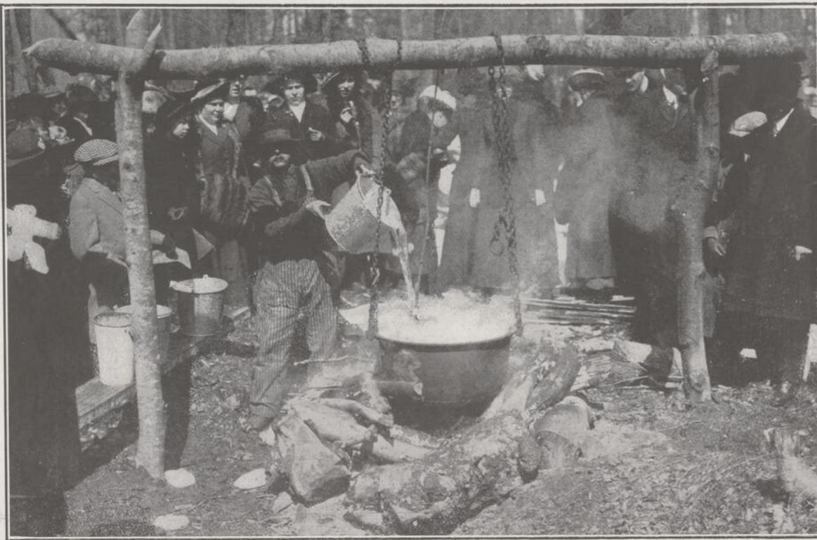
A DAY IN A SUGAR-BUSH IN THE EASTERN TOWNSHIPS OF QUEBEC —Quite recently a party of about 250 Montrealers were taken by special train to one of the largest sugar camps in the Eastern Townships, namely that owned by Messrs. Gunn-Langlois at Foster, a few miles from Knowlton. There the members of the party witnessed the various processes by which maple syrup and sugar are evolved from the sap which courses upward through the sugar maples at this period of the year. In the above picture the old-fashioned method of boiling down the sap is illustrated. On the end of the stick which hangs above the centre of the pot is a piece of fat pork. The heat from the fire causes this to slowly melt, and the drops of lard falling on the surface of the sap prevent the latter from boiling over. Syrup and sugar made in the open kettles are not nearly as light in color nor as good in quality as that made in the modern evaporators.

As it comes from the maple tree is a very dilute solution containing from 95 to 98 per cent. of water, about 3 per cent. sugar, and small quantities of mineral constituents. The making of maple syrup or sugar consists primarily in getting rid of the surplus water by evaporation. Early sugar makers used very crude utensils and methods and made as a rule correspondingly inferior products as compared with the high-class goods made on the well-equipped and well managed sugar places of the present day. The modern sugar maker recognizes that sap, like milk, is a very perishable product being an excellent medium for the development of fermentative organisms. To make a good sugar or syrup it is necessary, therefore, to have an equipment which will allow for the least possible contamination of the product in all stages of manufacture. Not only must thorough cleanliness be observed but transformation of the new sap to the finished product must be direct and speedy. The sugar house of a modern plant is not only for making and putting up the products but also for storing buckets, pails, spouts and other equipment from one spring to another. It has been a long struggle from the iron kettle, used in sugar making by the Indians and our forefathers, to the modern evaporator that is necessary for the making of a high-priced product. In pioneer days the saving of fuel had not to be considered nor was quality of product a live issue. Most