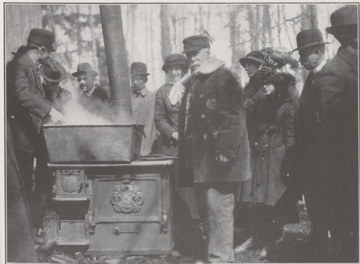
A DAY IN AN EASTERN TOWNSHIPS' SUGAR-BUSH —Converting maple syrup into sugar by boiling it down in a tin on the top of a modern range. Several hours are usually occupied in effecting the transformation. When the syrup has reached the consistency of "wax" it is sometimes poured on snow and eaten. Thermometer readings are frequently taken during the process of boiling down.