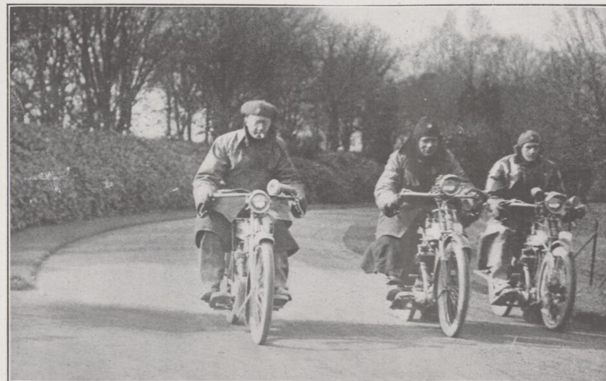
ON SERVICE IN ULSTER—Three despatch riders arriving at the Ulstermen's headquarters at Craigavon after an all-night run through "hostile territory."

tion than that which closes to the blind one great channel of common experience and common intercourse, and cuts them off from the chief fields of knowledge and activity."