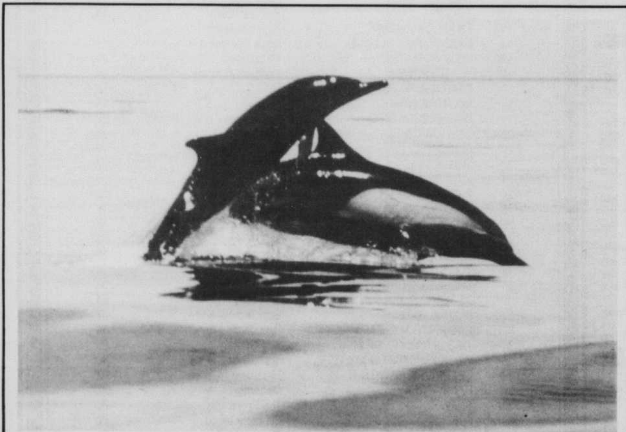
If Only Dolphins Could Talk a National Audubon Society Special examining the

Run for your Wife runs until July 14. The curtain rises Tuesday and Thursday at 2 and 8:30, Wednesday and Friday at 8:30, Saturday at 5 and 8:30. Tickets are $15.50 Tuesday, Wednesday and Thursday and $18