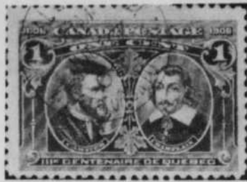
1 cent denomination commemorating Quebec Tercentenary issued in 1908.

Jacques Cartier was next depicted on a Canadian stamp on July 1, 1934. It was to commemorate the 400th anniversary of the Cartier's discovery of Cana-