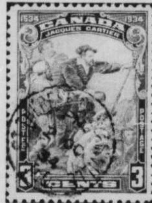
400th anniversary of Cartier's arrival in the new world.

da. The three cent denomination offers several varieties. There is the burr on the shoulder and the scar-face varieties. The latter appears on the kneeling seaman. In addition these are hairlines