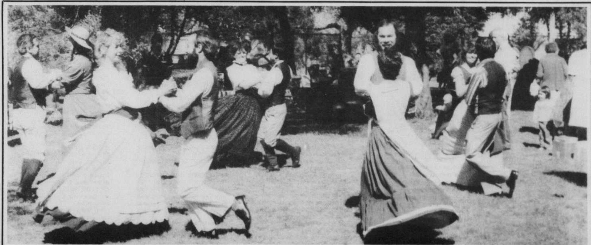
Drummondville's Folklore Festival begins this weekend. The 10-day festival

Merrill's Showplace is featuring Bruce Willis in Die Hard 2 at 6:50 and 9:20. Also showing: The Jettsons and Robocop 2 .