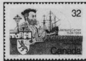
Issued to commemorate the 450th anniversary of the landing of Jacques Cartier on April 20, 1984.

and imperforated pairs. While the normal stamp is rather inexpensive, the varieties are rather high, especially in the mint condition.