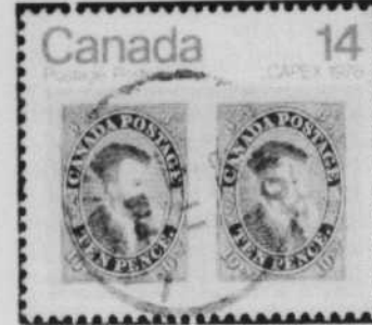
Replica of 10d issued in 1855. This stamp was issued in 1978 on the occasion of the Canadian International Philatelic Exhibition, Toronto

da. The three cent denomination offers several varieties. There is the burr on the shoulder and the scar-face varieties. The latter appears on the kneeling seaman. In addition these are hairlines