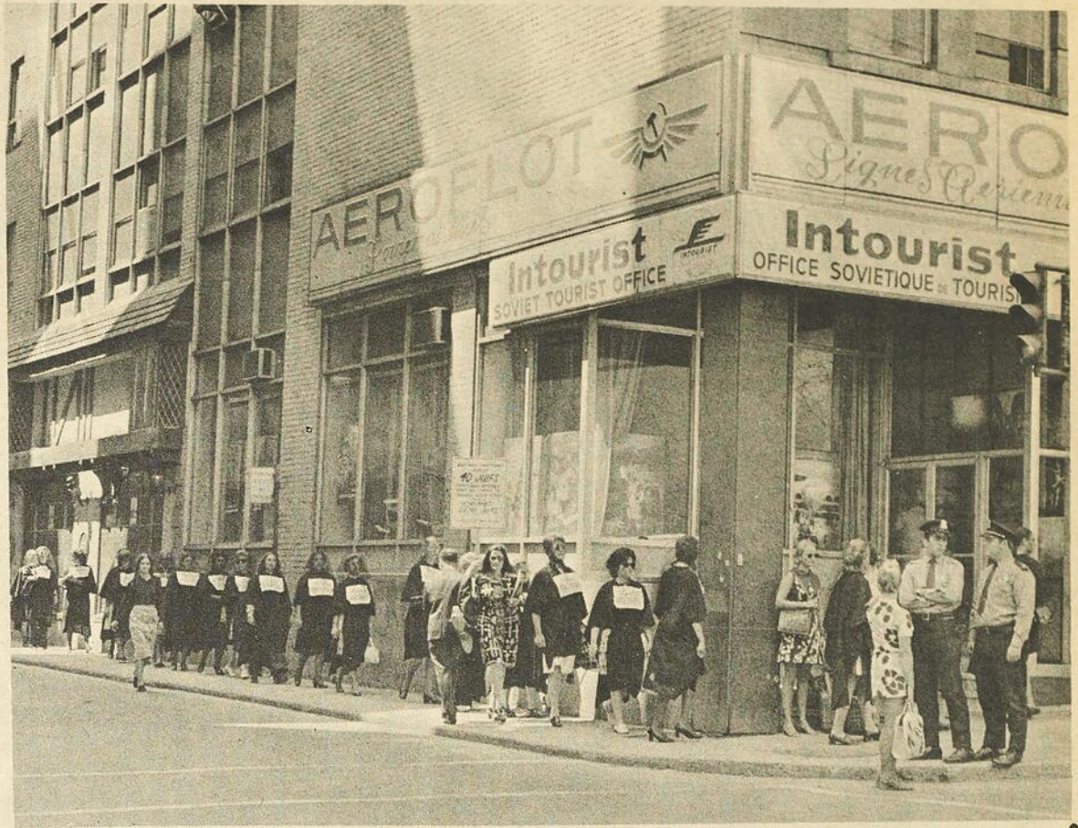
TIMED FOR U.S.S.R. DAY at "Man and His World" in Montreal this summer, a Silent Vigil is conducted by black-garbed Jewish women in front of the Intourist/Aeroflot office as a protest on behalf of Soviet Jewry. The silent women carried placards in English, French and Yiddish, and the Vigil was conducted with quiet dignity and unmarred by any incidents.

Today is different only in that the problems carry different faces. But the decisions are for the continuity of a Jewish existence in a pluralistic society very harmonious to it but posing the essential need of a national organization through which some of the directions can be charted and their implementation realized.