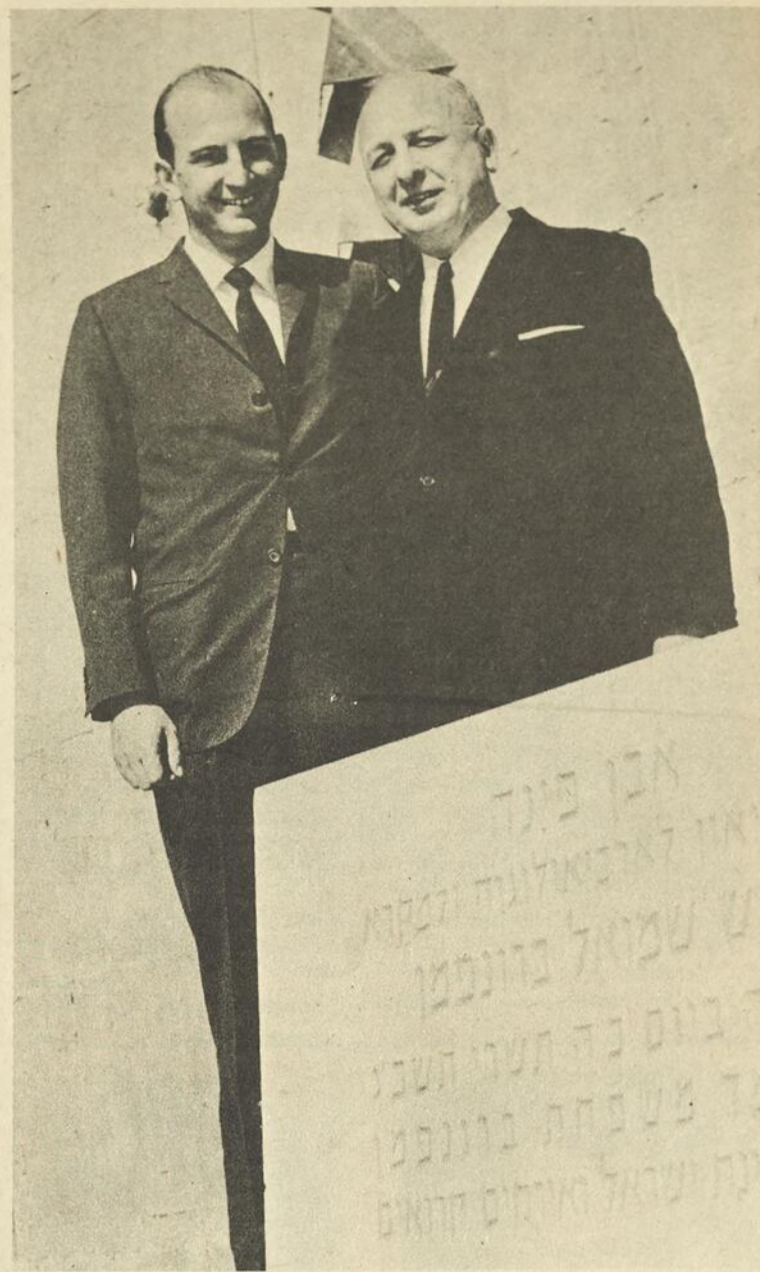
A PROUD FATHER AND A PROUD SON share a happy occasion — Samuel Bronfman with son Charles at the dedication of the Samuel Bronfman Biblical and Archaeological Museum, a gift of the Bronfman children in honor of their father, in Israel in 1962.

SAMUEL BRONFMAN — planner of organizational unity. Examples: how he created the United Jewish Refugee and Relief Agencies