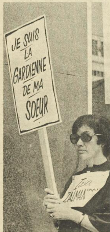
I AM MY SISTER'S KEEPER, says this solemn demonstrator in Montreal, one of 40 Jewish women garbed in black robes

A giant manifestation of protest and concern for Soviet Jewry will greet Alexei Kosygin when the Soviet Premier visits Canada in October.