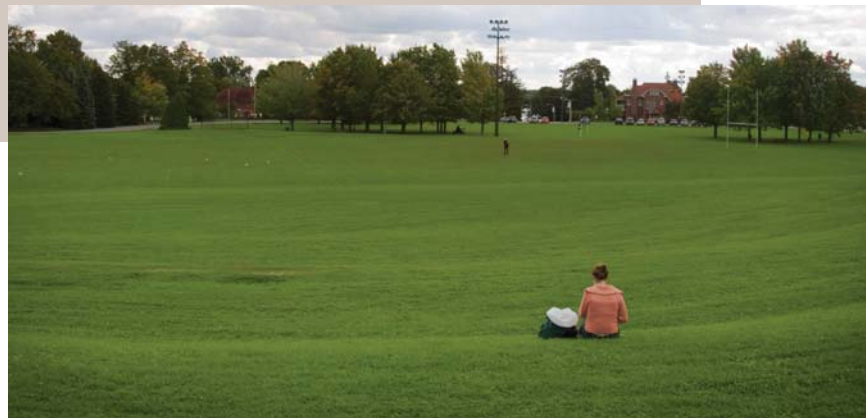
Macdonald Campus, Ste. Anne de Bellevue

McGill is taking the possibility of widespread illness due to the H1N1 flu pandemic very seriously. A working group of managers and administrators has met through the summer to get contingency plans in place and develop policies and procedures that can help ensure the smooth functioning of the University in the event of significant absences from work or from classes. A considerable amount of information related to the flu and how it may affect McGill can be found at www.mcgill.ca/health . This website is updated frequently and other communication tools will be employed as well to keep the McGill community up to date as we head into the fall.