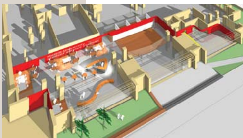
Artist renderings of the "Service Point," which will amalgamate many student services in one convenient location.