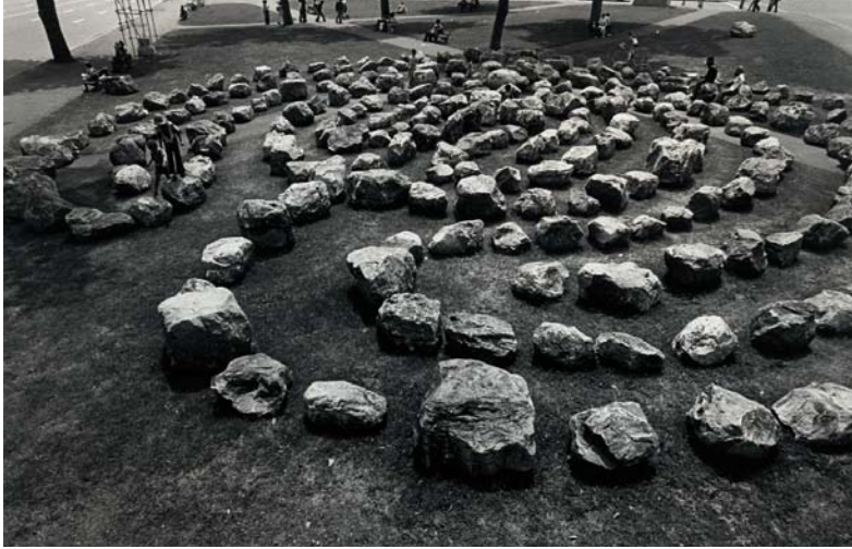
21 Stone Maze , 1976, created in Montréal at the intersection of Sherbrooke and Amherst streets for Corridart and dismantled the day before the event.