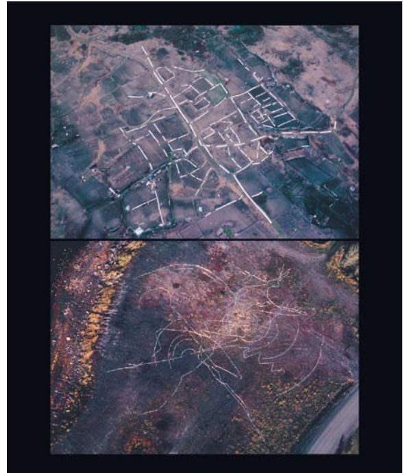
27 Village Inondé + Water Spirit – Longueuil, 1983 + 1985, about 2000 Photograph. Lambda print on polyester 152.4 x 127 cm Gift of the artist, RD-2007-010