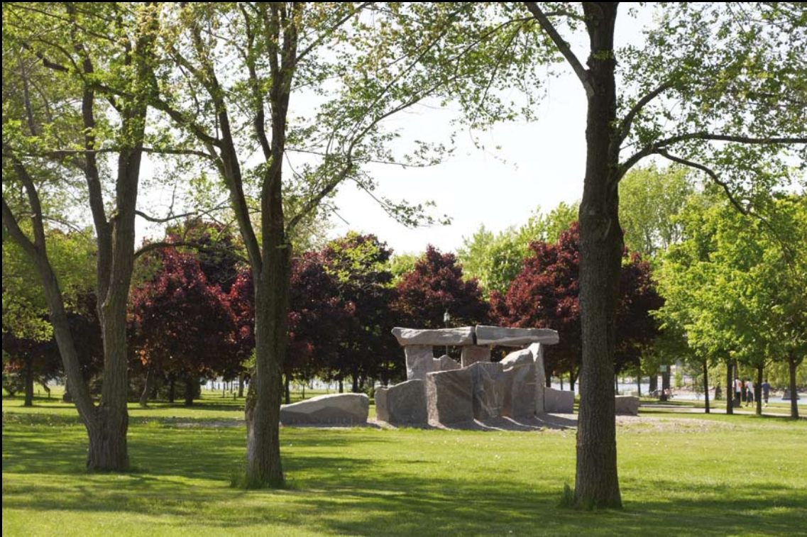
Front cover and inside back cover photos of Vortexit II (detail): Marc Pitre Above, and back cover photo of the artist: Ève Katinoglou