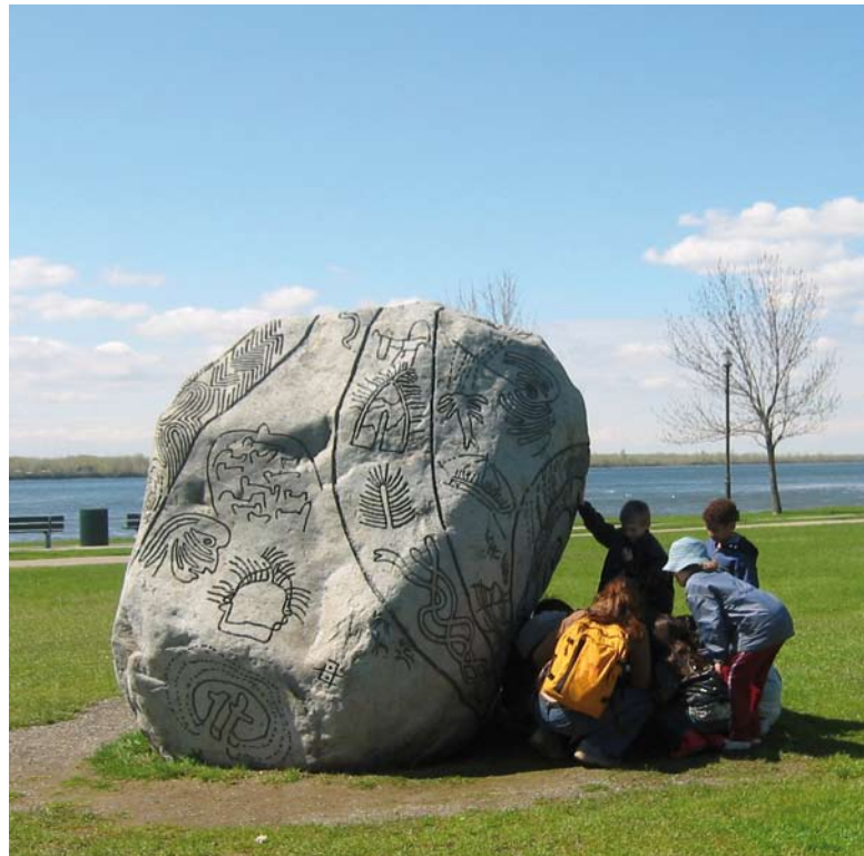
3 Story Rock studied by children on a field trip, Musée plein air de Lachine, 2003