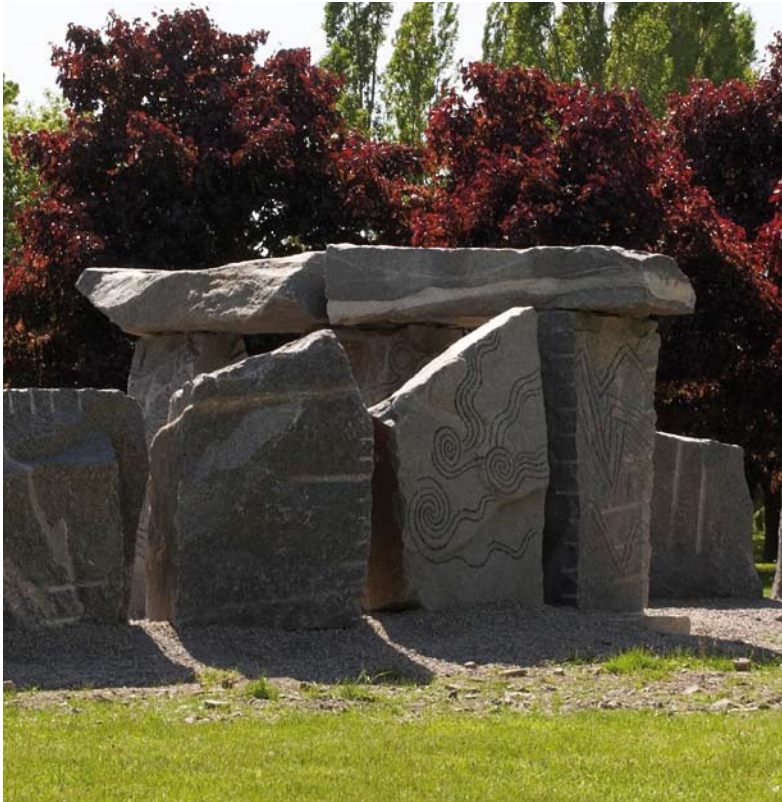
22 Vortexit II , 2009, side view with detail of the outer-face engravings, René-Lévesque Park, Musée plein air de Lachine.