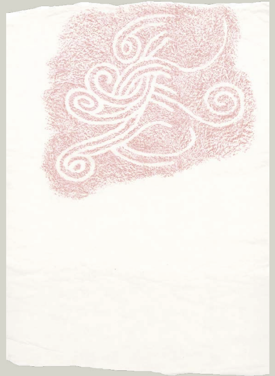
16 and 17 Untitled (2) , 2008 Rubbings of engravings on the centre and west pillars of Vortexit Coloured pencil on Tyvek 221 x 153 cm, RD-2008-007 201 x 153 cm, RD-2008-006