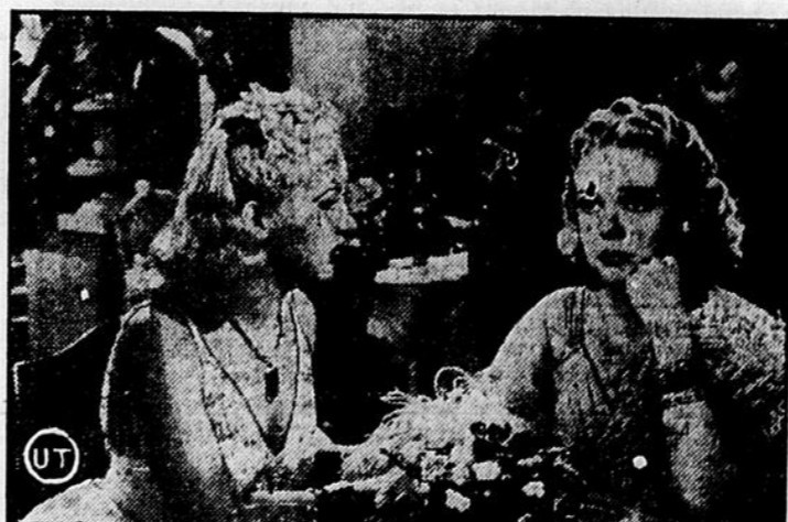
Alice Faye and Betty Grable are starred in "Tin Pan Alley," spectacular musical on Saturday playing until Tuesday night. Jack Oakie and John Payne head the featured list.