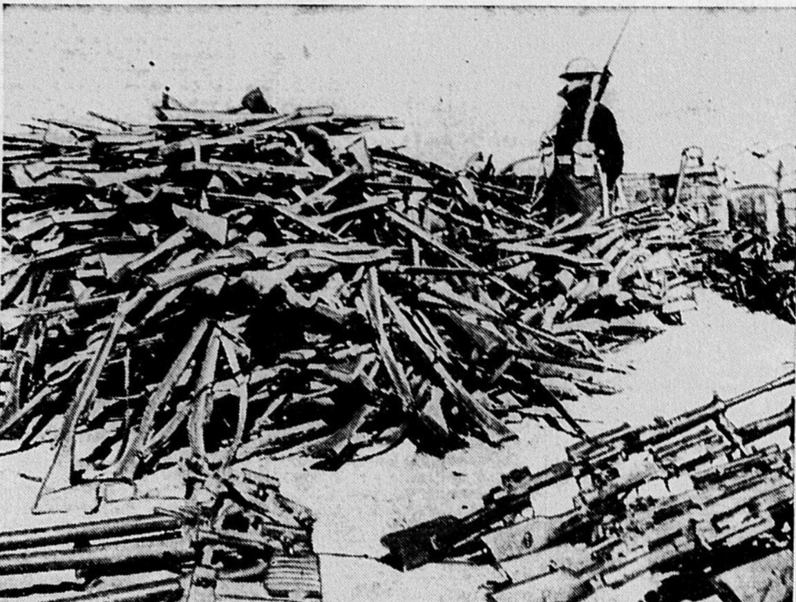
One-sided disarmament is no problem in Libya. Shown above is a huge pile of rifles and a ring of machine guns surrounding it, taken from Italian troops when the British captured Bardia.