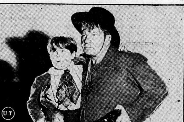
Bobs Watson and Wallace Beery in an exciting scene from the thrilling, laugh-filled romance, "Wyoming," which will be at the Monkland United Theatre on Sunday playing until Tuesday night.