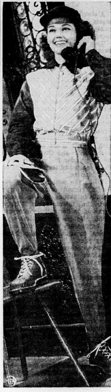
The patriotic motif is highlighted in this smart ski outfit. The wind-breaker is red, white and blue striped poplin and plain navy sleeves, collar and narrow yoke. The pearl grey ski pants are of English gabardine.