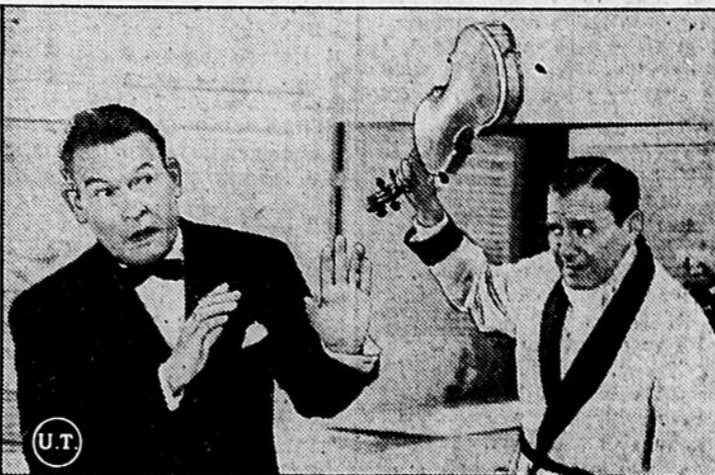
Looks as if Jack Benny is about to crown Fred Allen with a violin in this scene from the uproarious production "Love Thy Neighbor," which will be at the Westmount United Theatre starting Sunday playing until Tuesday night.