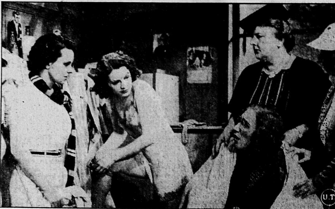
Arthur Askey as "Charley's (Big-Hearted) Aunt," is pictured in an embarrassing scene with lovely Phyllis Calvert in the uproarious British comedy, which is now playing at the Snowdon United Theatre.