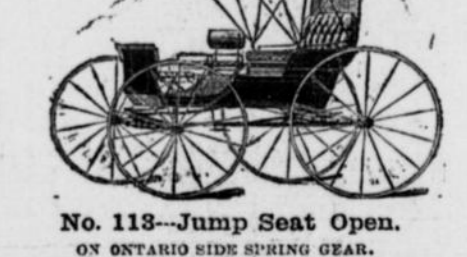
No. 113—Jump Seat Open. ON ONTARIO SIDE SPRING GEAR.

THE FROST & WOOD CO., Ltd., 78 St. Paul Street, Quebec, General Agents.