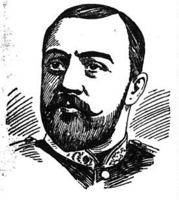
GEN. PANDO, Second in Command to Gen. Blanco in Cuba. He has reached Santiago with 8000 men, and is reported to be wounded.

the pursuer. She stood well out from shore to try to cut off the Colon at a point jutting out into the sea far ahead. The Oregon kept a middle course a mile from the cruiser.