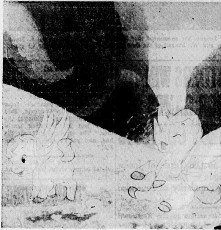
A scene from "A Pastoral Symphony," one of the seven symphonies played by the Philadelphia Symphony Orchestra under the direction of Leopold Stokowski in "Fantasia," which is now playing at the Kent Theatre.