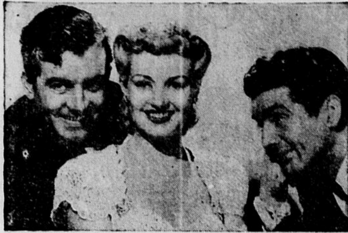
John Payne, Betty Grable and Victor Mature in a scene from "Footlight Serenade," which opens at the York United Theatre on Saturday playing until Tuesday night.