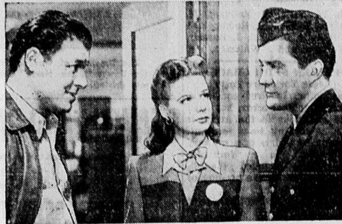
Jack Carson, Ann Sheridan and Dennis Morgan in a scene from "Wings For The Eagle," which opens at the Monkland United Theatre on Sunday playing until Tuesday night.