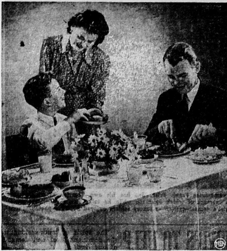
This wise mother knows that light, well-made muffins make even a plain meal interesting and appetizing.