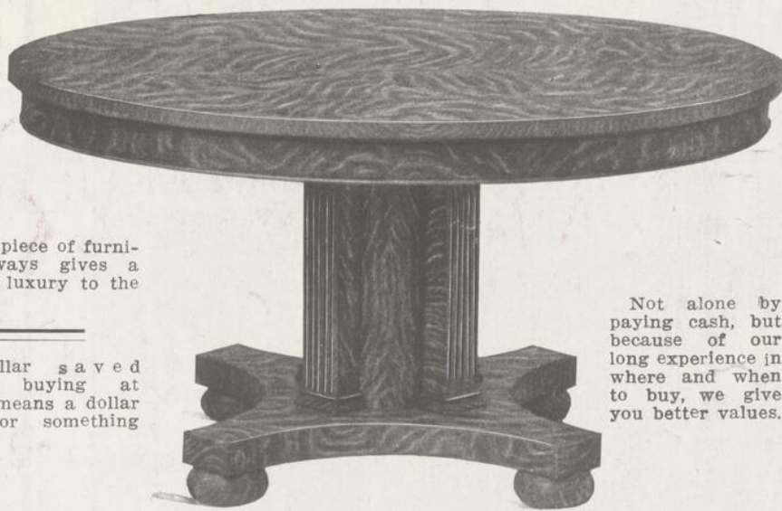
52-52 Extension Table, selected quarter cut oak, polished, Early English or golden finish, top 54 x 64 inches, extending to 8 feet. Price . . . . . $40.00