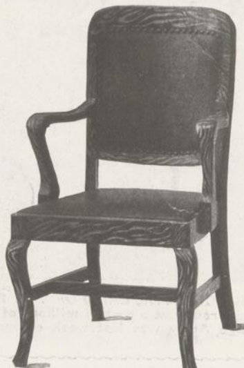
31-183 Arm Dining Room Chair, quarter cut oak, polished, Early English or golden finish, removable seat, upholstered in best quality leather. Price . . . $9.50

Are you acquainted with the high-class household furnishings we sell, other than what is shown in the general Catalogue?—that is, the finer qualities, such as are sometimes called "higher-priced goods"—where better material, finer finish, extra carving or weaving or designing increases the cost. In this class of merchandise, just as in other lines of goods, our large purchases and knowledge of the best markets keep the price low down, and the long experience of the buyers enables them to select that which will give desirable service at economical prices. To let you know just what we have to offer, a Catalogue of high-class Carpets, Floor Coverings, Curtains, Draperies, Furniture, Wall Papers, Paints, has been prepared, displaying in description and picture some of the articles. A sample of the illustrations is presented here, but write for the House-furnishing Catalogue, it will surely be money in your pocket.