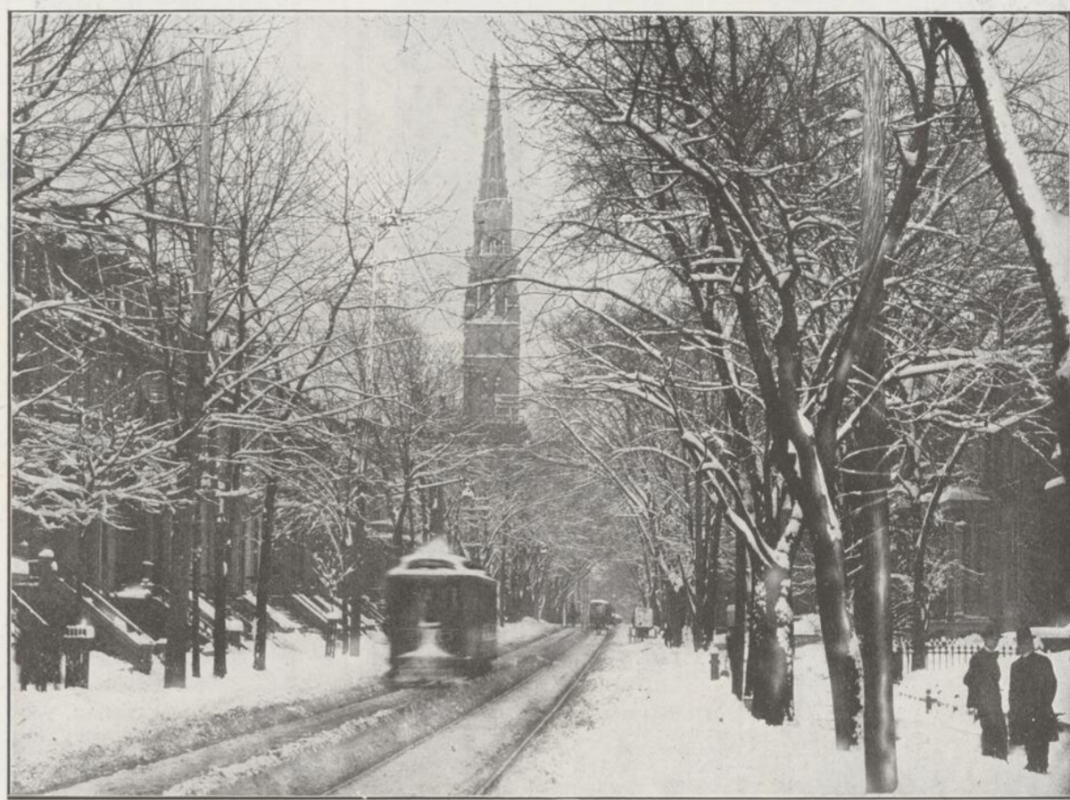
A NOVEMBER SNOWSTORM IN MONTREAL—St. Denis street, between Ontario and St. Catherine streets, as it looked on the morning after the first snow-storm of the season.