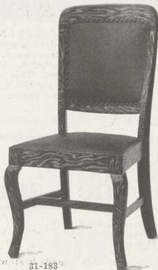
31-183 Dining Room Chair, quarter cut oak, polished, Early English or golden finish, removable seats, upholstered in best quality leather. Price . . . . . $7.25

WRITE FOR THIS CATALOGUE IT WILL HELP IN CHOOSING FURNISHINGS