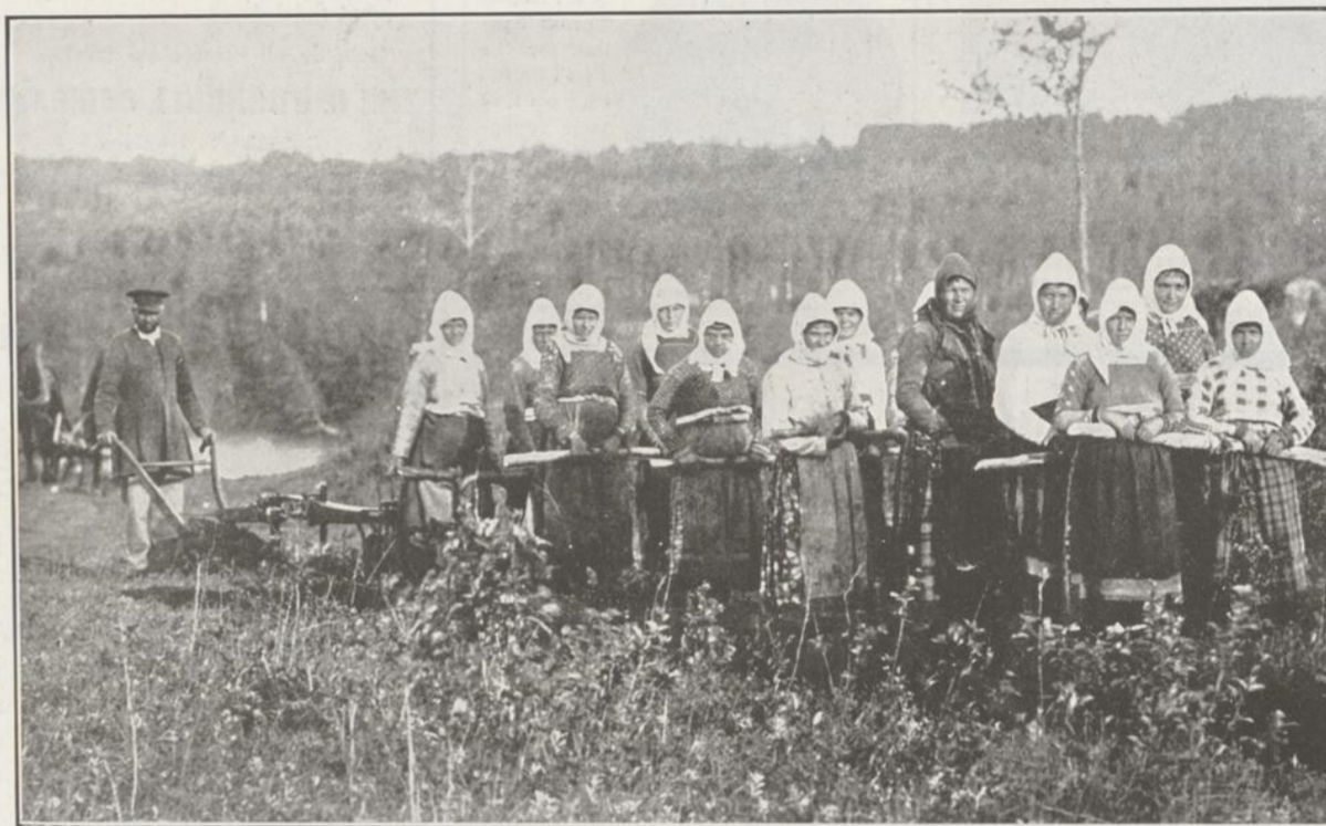
DOUKHOBOR WOMEN PLOUGHING IN THE YORKTON DISTRICT—This is not an uncommon sight each spring and fall in the Doukhobor settlements of the North-West. The women perform the work willingly and faithfully, and do not seem to regard it as a hardship.