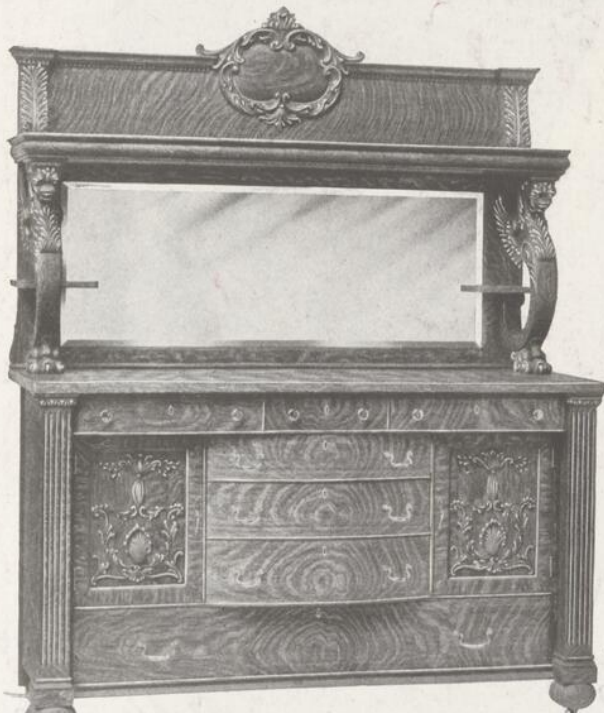
52-52 Sideboard, selected quarter cut oak, Early English or golden finish, polished, 82 inches high, top 26 x 66 inches. Price . . . . . $100.00