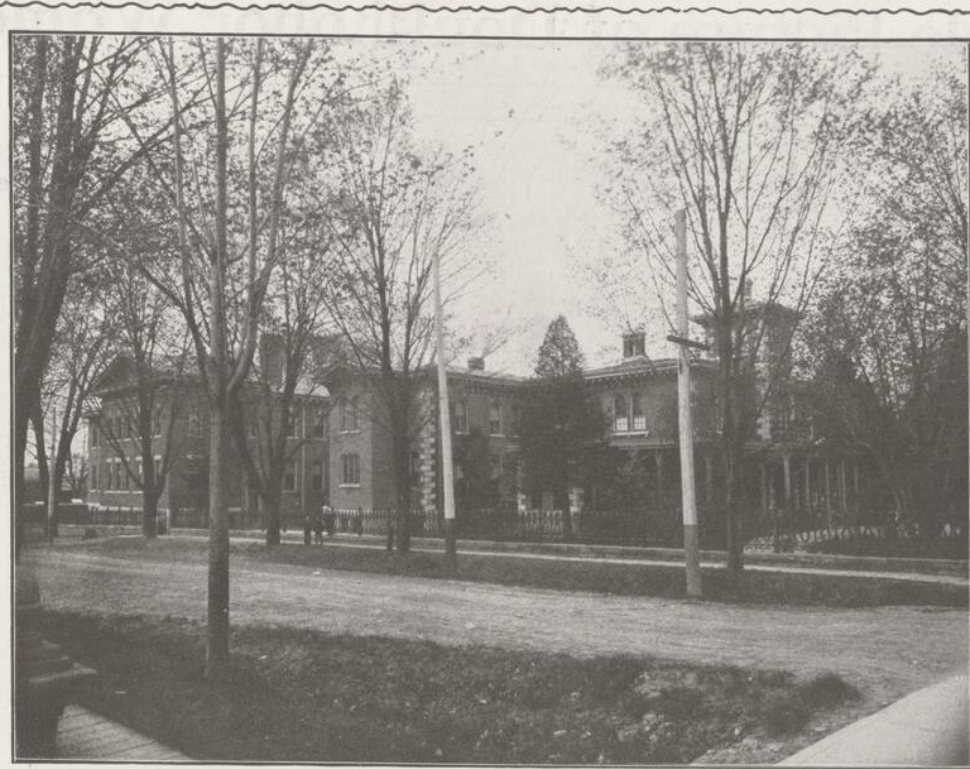
ST. AGNES' SCHOOL, ELMPool, BELLEVILLE, ONT.