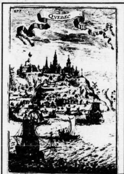
Bibliothèque Nationale du Québec

AT THE DIVISION Assured, was declar Assured, provided the this rate of Bonus the But the Policy-hol average period of life,