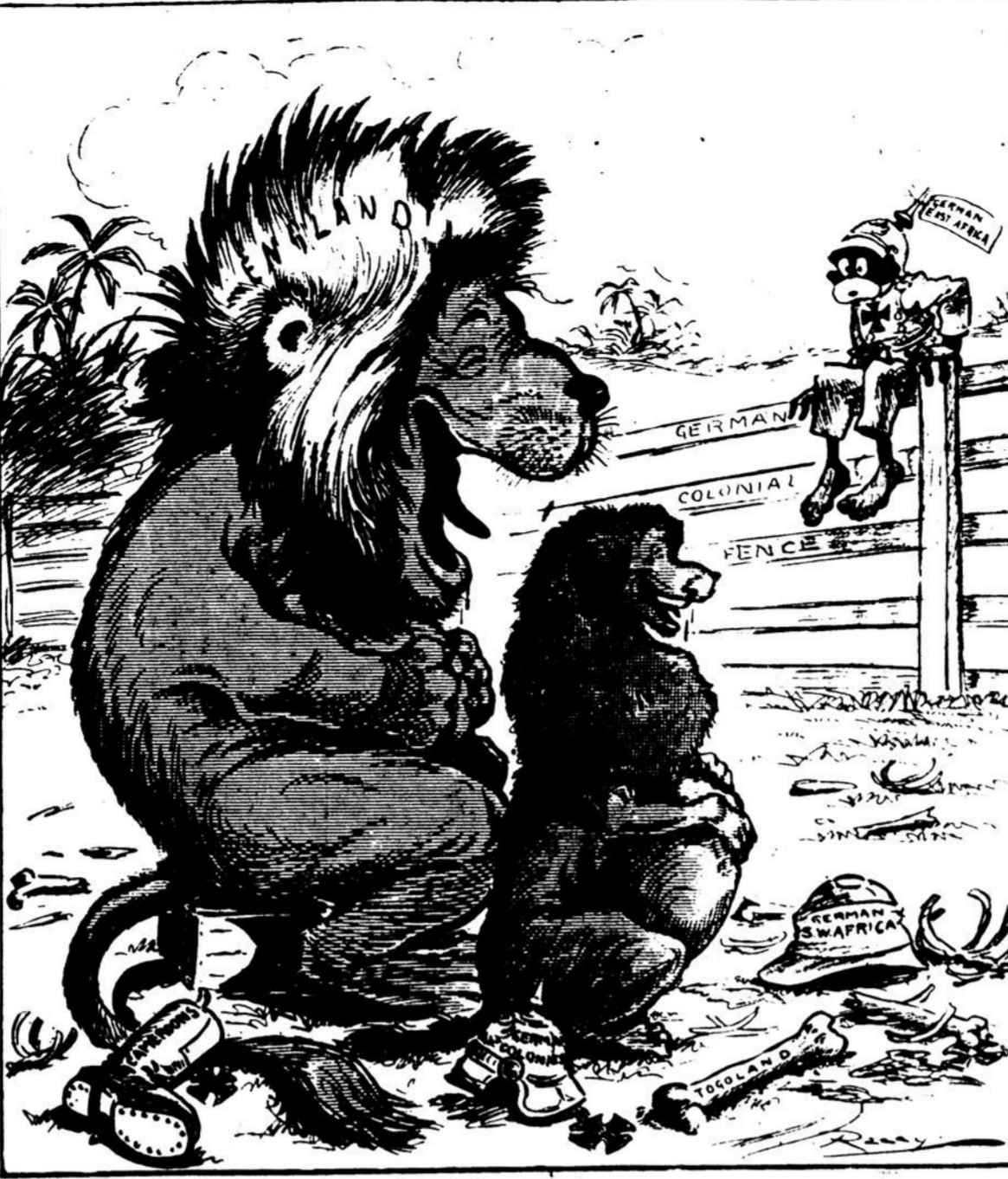
—and then there was one. (And he won't last long.)