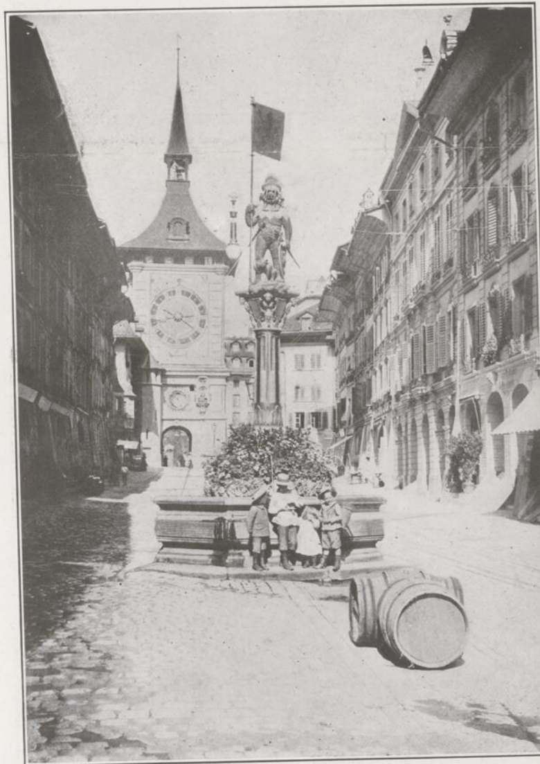
THE OPENING OF THE SWISS NATIONAL EXHIBITION—The Zähringer Fountain and the Ancient Clock Tower at Bern, in which city the Swiss National Exhibition is now being held. The Clock Tower is perhaps the best known landmark of Switzerland's capital. It is the oldest of Bern's ancient gateways, and dates from the fifteenth century. Its curious clock is described in the article that is published on this page.