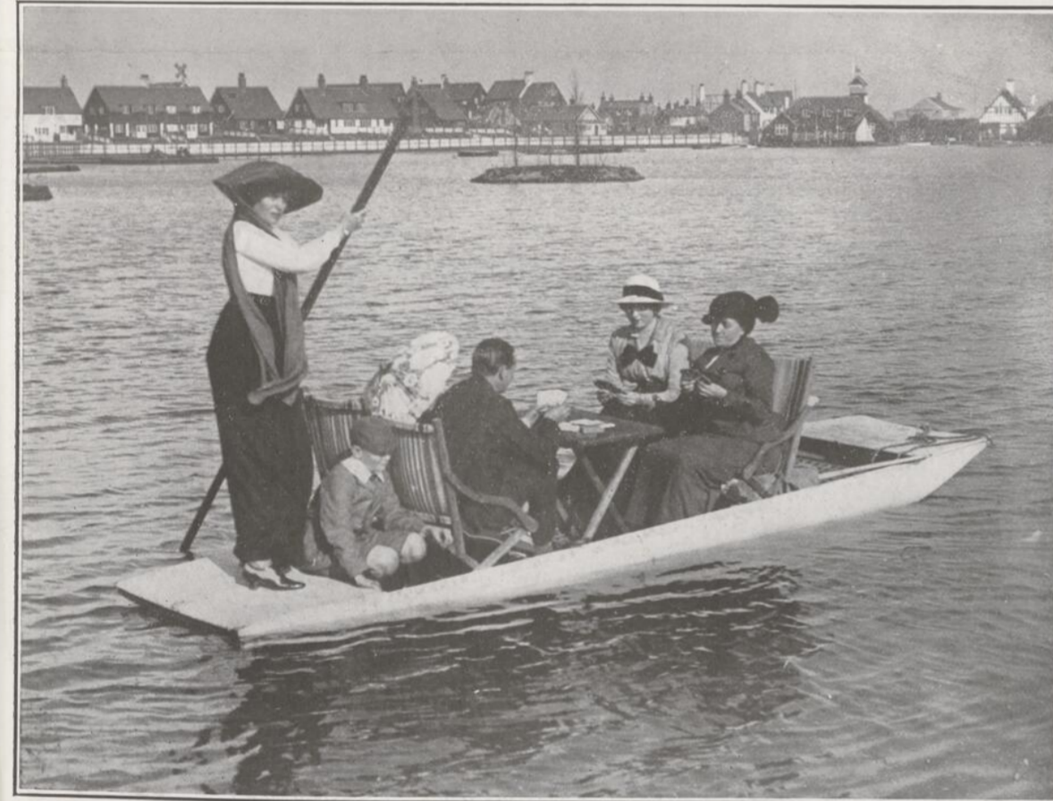
A NOVEL BRIDGE PARTY—Englishmen recently experienced a "hot" spell, when a maximum temperature of 73 degrees was registered. Thousands fled to sea-side resorts, while others adopted all sorts of expedients for keeping themselves cool. At Thorpeness, in Suffolk, a water party was arranged. Several punts were requisitioned and these were fitted up with chairs and tables. In the above picture one of these punts is shown; its occupants are engaged in playing a game of bridge..