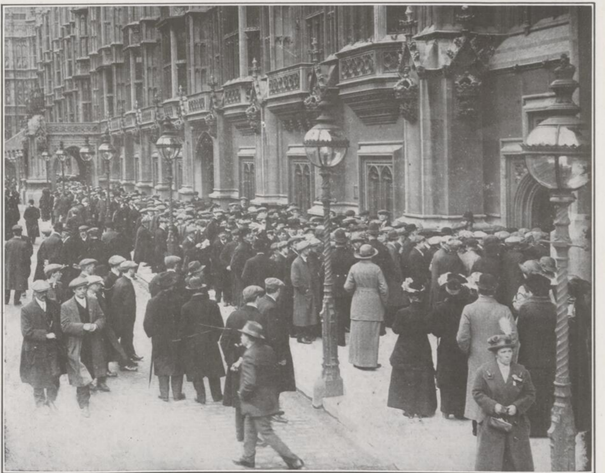
A PARLIAMENTARY "RUSH"—After the recent memorable match between Burnley and Liverpool at the Crystal Palace, London, a large number of North Country enthusiasts stormed the Houses of Parliament, and eventually succeeded in gaining access to the galleries of the House of Lords and the House of Commons. At Whitehall they also succeeded in accomplishing that which Londoners would not dare to do. They scrambled to the tops of the lamp-posts and fences in order that they might witness the changing of the Guard. In the above picture they are seen outside the Houses of Parliament.