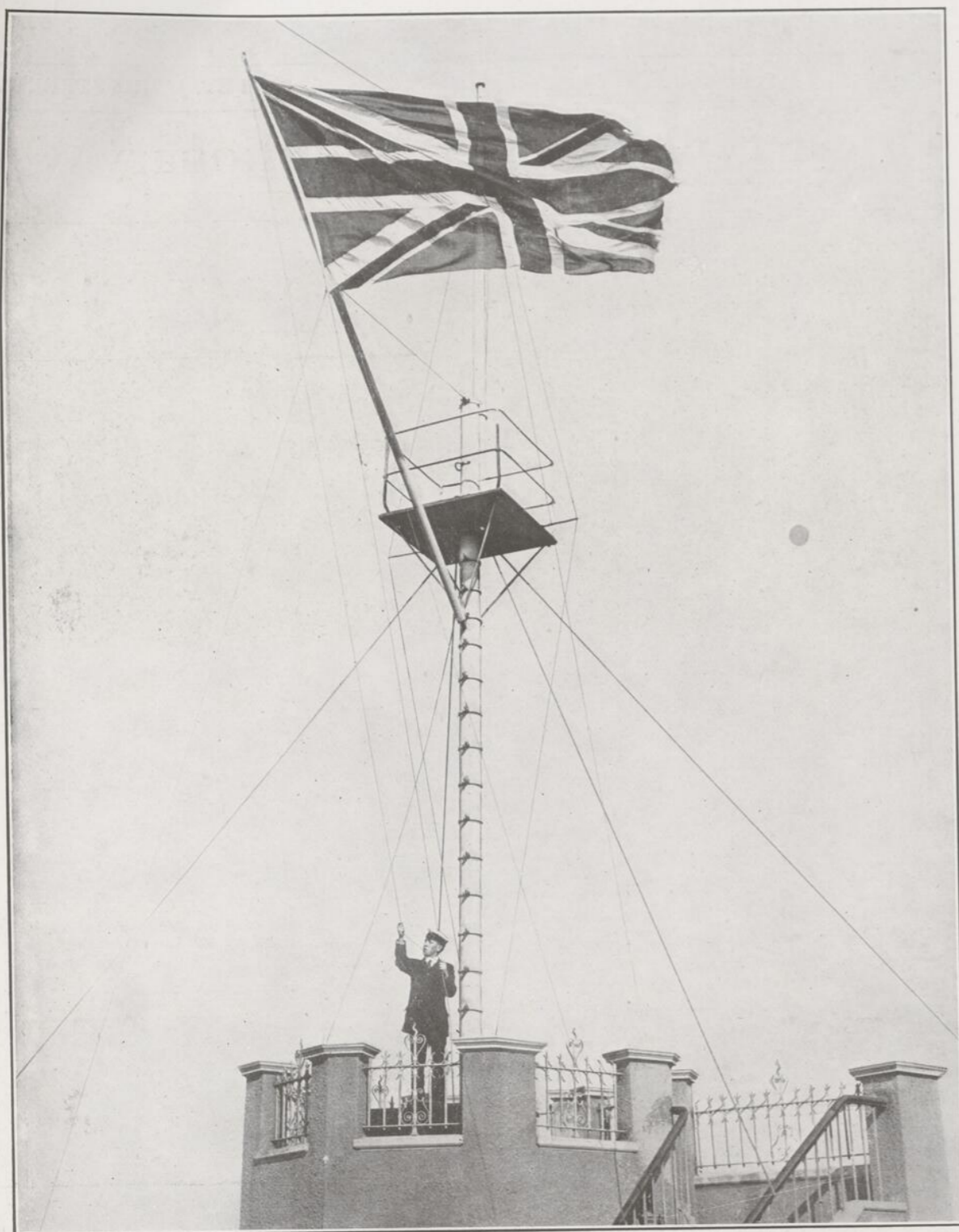
HOW THE ULSTER VOLUNTEERS RECEIVED THE BRITISH WARSHIPS AT BELFAST—As the men-o'-war dropped anchor in Belfast Lough, the Union Jack was raised to the masthead of the signalling station of the Ulster Volunteer Force and the Volunteers on the quay sang the first verse of the National Anthem. The sailors and marines of the warships responded to the "salute" by singing the second verse of the Anthem. A little later the sailors who secured "shore leave" were fraternizing with the men whose opposition to Home Rule had resulted in the despatch of the warships to Belfast. The above picture perpetuates the raising of the Union Jack.

cleverly thrown across the deep furrow formed by the river bed, which in the early feudal times proved a natural fortification of great value. The old part of the city, occupying this striking promontory, has carefully preserved its attractive medieval features; modern Berne, however, forms an assembly of smart dwelling houses and elegant villas, charmingly framed in a mass of verdant foliage and artistically laid out gardens. A delicious old-world atmosphere greets the newcomer as soon as he emerges from the railroad station, and when he happens to have the good luck of arriving on one of those most important market days, he forgets that his first object was to visit a diplomatic city, and rejoices in the fact that he is given a chance to come into close contact with the congenial peasant folk. Not far away from the railroad station the Spitalgasse beckons to us—a typical street of old Berne with the picturesque Laubeu (arcades), which form the most distinctive feature of Bernese architecture. Chronicles of the middle ages refer to them in a special paragraph, stating that "what is especially charming, all the houses are adorned with arcades towards the street, so that one may in rain or storm walk through the streets of the town "dry-shod," and as of old, so are these cosy arcades to-day the chief means of circulation for pedestrians.