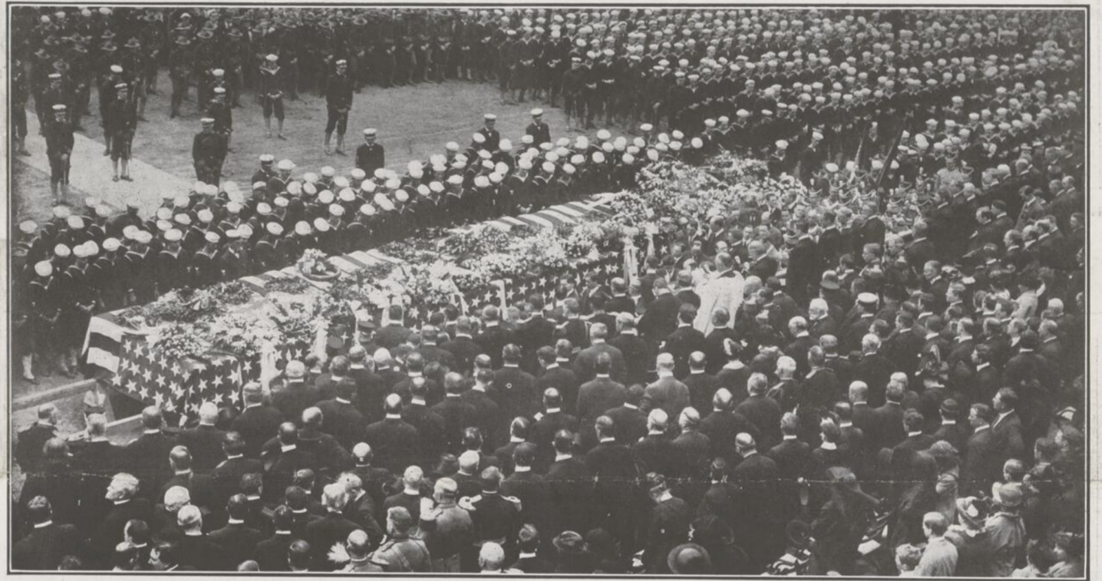
HEROES WHO WERE HONORED AS ADMIRALS—After the procession had reached the Brooklyn Navy Yard an impressive religious service was conducted, at which President Wilson delivered an oration. The bodies of the dead were then shipped to relatives for further honors in their native cities. The above picture perpetuates the funeral exercises in the Brooklyn Navy Yard, which were witnessed by 50,000 people.

HIS Majesty the King recently created a precedent by attending the Burnley-Liverpool Soccer Match at the Crystal Palace, London. It was the first occasion on which a British Sovereign had officially attended a soccer game. His Majesty's visit is illustrated on this page.