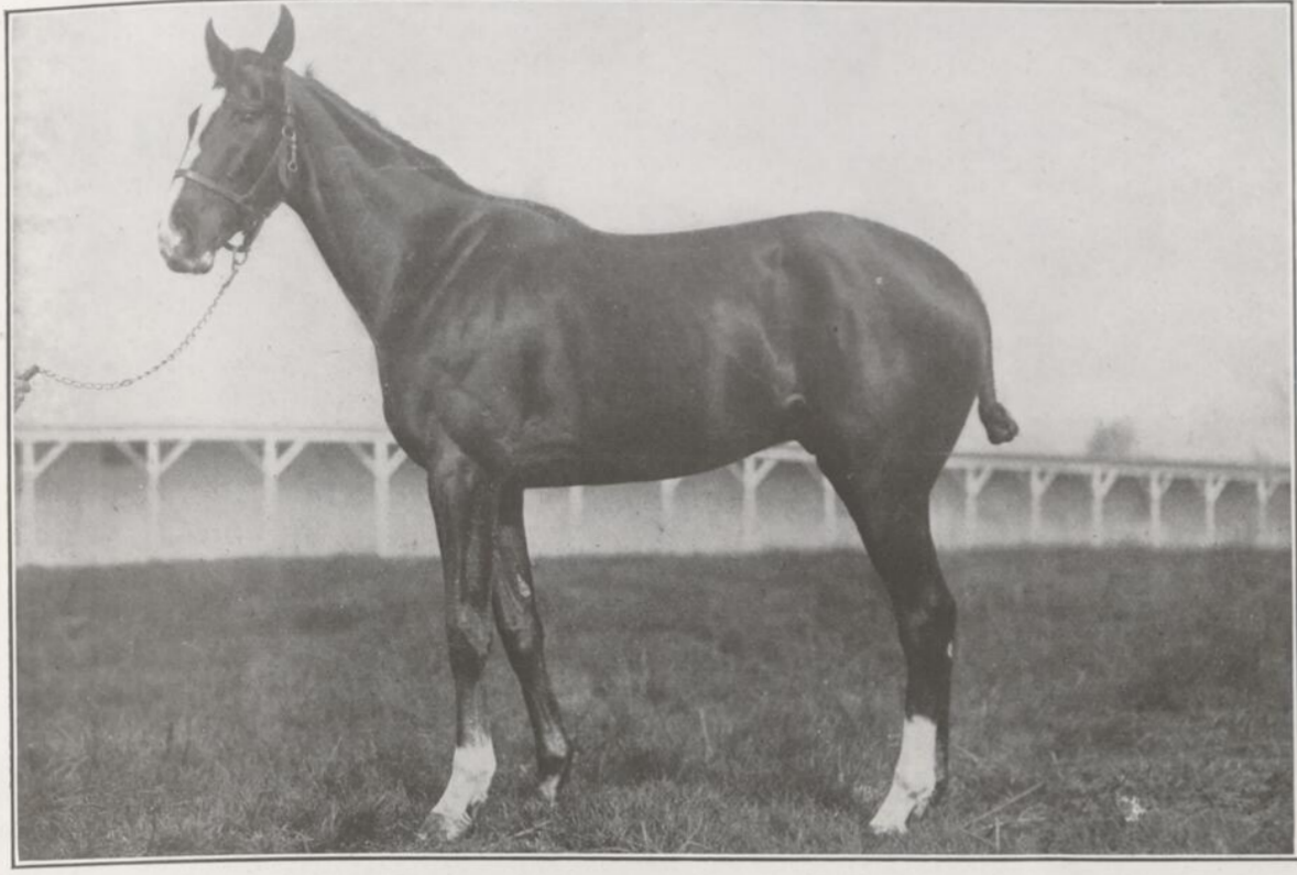
ENTERED FOR THE BIG INTERNATIONAL DERBY—Hodge, a well-known winner on the Southern tracks who ran second in the recent Kentucky Derby. Hodge is slated to be a sure starter in the coming big $20,000 International Derby at Dorval on June 13.