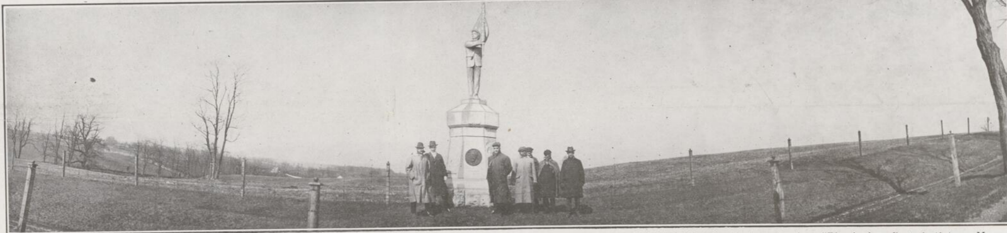
THE RECENT VISIT OF THE CANADIAN MINISTER OF MILITIA TO HISTORIC UNITED STATES BATTLEFIELDS—The Sunken Road or "Bloody Lane" at Antietam, Maryland. Here, on September 17, 1862, the North and South struggled for supremacy and the narrow road was literally filled with the dead of both armies who had fallen in the attacks and counter attacks that took place on this section of the battlefield.