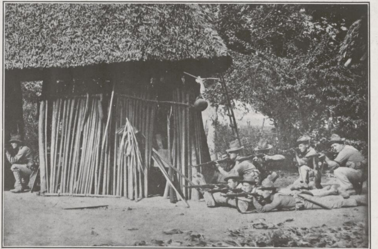
PICKING OFF THE MEXICANS—United States marines at the water works at Vera Cruz, picking off Mexicans who resisted the seizure of the water plant by the United States.