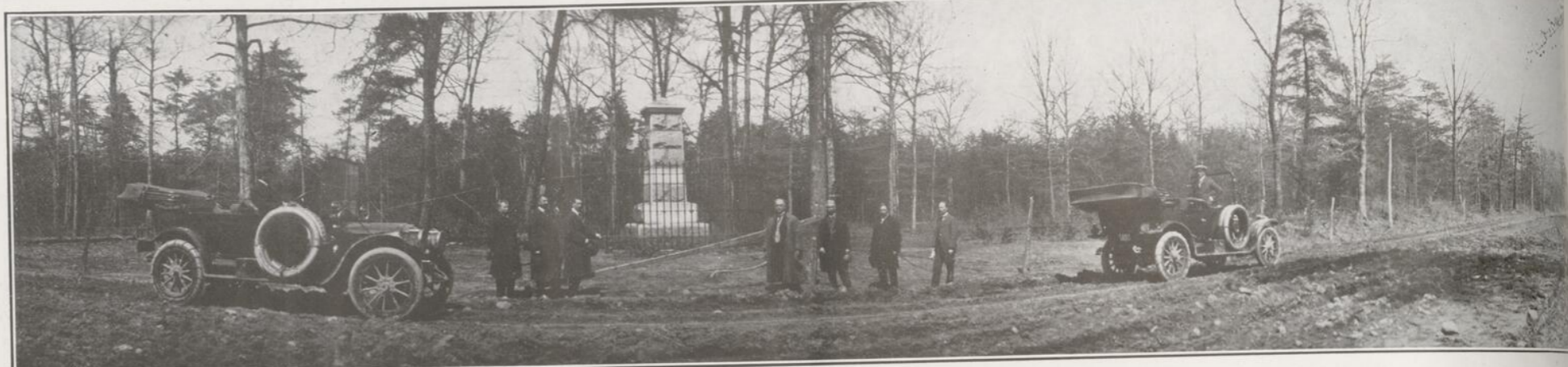
THE RECENT VISIT OF THE CANADIAN MINISTER OF MILITIA TO HISTORIC UNITED STATES BATTLEFIELDS—In the above picture the Hon. Sam Hughes and his members of his party are standing in front of the "Stonewall" Jackson Memorial at Chancellorsville, Virginia. This monument marks the site where General Jackson was mortally wounded by his own pickets on the night of May 2, 1863. At the close of the day he was reconnoitering the hostile positions when suddenly the Confederate opened fire upon his staff whom they mistook in the dark for Federal cavalry.