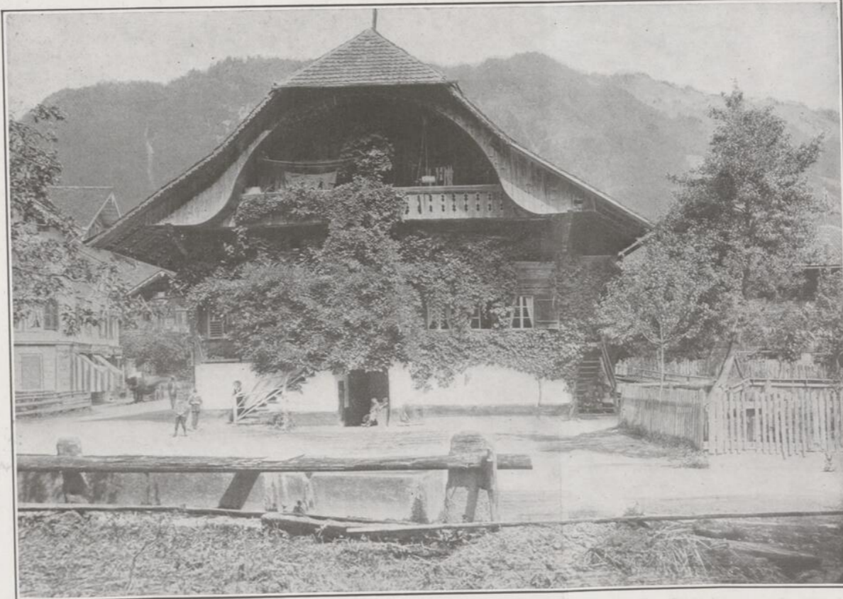
THE OPENING OF THE SWISS NATIONAL EXHIBITION—This event took place on Friday of last week in the presence of the President of the Swiss Republic and a large gathering, representative of almost every nation under the sun. The site of the Exhibition is on an elevated plateau on the north-west of Berne. It is open to the east and south and commands from every part a splendid view of the Bernese Oberland. The area of the Exhibition grounds measures some 500,000 square metres, of which total 135,000 metres are covered with buildings. The remainder of the site is laid out in such a way as to harmonize with the neighboring forest. The above picture shows one of the beautiful chalets in the Exhibition grounds.

everyday traffic. In Biblical times already we find the fountains mentioned as a meeting place, and while they are not used to the same extent in these modern days, yet we perceive that they are frequently patronized. Horses and cattle are watered here, and the children take a particular delight in making a fountain the centre of their playground. Yea, some old-fashioned women could not imagine the possibility of a successful wash day, if they were not able to avail themselves of the abundant water supply of some fountain, and