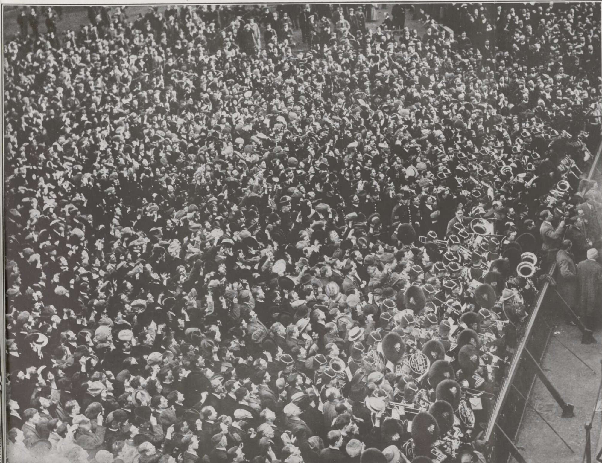
A GREAT MOMENT IN SOCCER HISTORY—The King presenting the famous English Cup to Burnley, the winners over Liverpool in the final game at the Crystal Palace on April 25th. The score was 1 to 0, and the game was made memorable by the presence of the King. This was the first occasion on which a reigning monarch had attended a Cup Final. Our picture shows part of the great gathering which witnessed the event and remained till the King presented the Cup to Burnley's captain.

HIS Majesty the King recently created a precedent by attending the Burnley-Liverpool Soccer Match at the Crystal Palace, London. It was the first occasion on which a British Sovereign had officially attended a soccer game. His Majesty's visit is illustrated on this page.