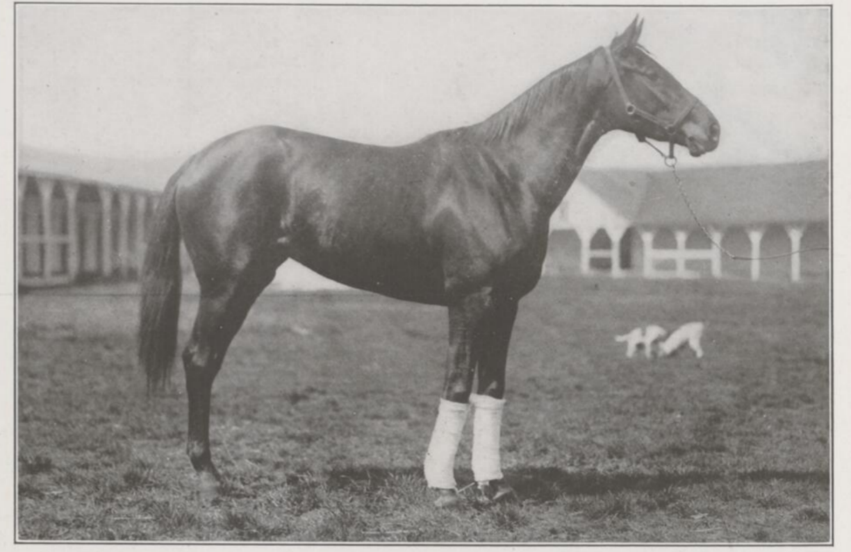
A WELL-KNOWN HORSE COMING TO CANADA—Bronswing, who won the Oakes at Lexington, Ky., and finished third in the recent Kentucky Derby is entered to start in the great International Derby at Dorval to be run June 13, and which is worth $20,000, of which $13,000 goes to the winner.