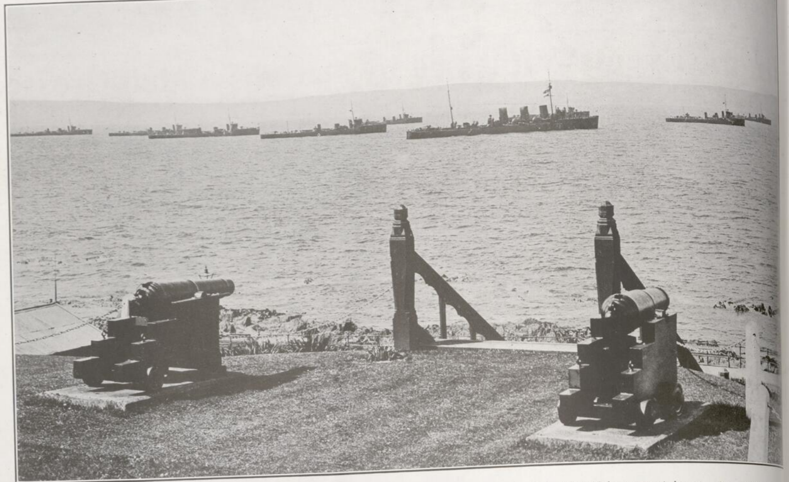
THE FOURTH DESTROYER FLOTILLA AT BELFAST—As a result of the gun-running by the Ulster Volunteers at Larne the British Admiralty despatched a flotilla of warships to Belfast Lough to preserve the peace. The above picture shows the flotilla riding at anchor in Bangor, Ireland—a short distance away from Belfast. The Ulster Volunteers gave the men of the warships a splendid welcome.

cleverly thrown across the deep furrow formed by the river bed, which in the early feudal times proved a natural fortification of great value. The old part of the city, occupying this striking promontory, has carefully preserved its attractive medieval features; modern Berne, however, forms an assembly of smart dwelling houses and elegant villas, charmingly framed in a mass of verdant foliage and artistically laid out gardens. A delicious old-world atmosphere greets the newcomer as soon as he emerges from the railroad station, and when he happens to have the good luck of arriving on one of those most important market days, he forgets that his first object was to visit a diplomatic city, and rejoices in the fact that he is given a chance to come into close contact with the congenial peasant folk. Not far away from the railroad station the Spitalgasse beckons to us—a typical street of old Berne with the picturesque Laubeu (arcades), which form the most distinctive feature of Bernese architecture. Chronicles of the middle ages refer to them in a special paragraph, stating that "what is especially charming, all the houses are adorned with arcades towards the street, so that one may in rain or storm walk through the streets of the town "dry-shod," and as of old, so are these cosy arcades to-day the chief means of circulation for pedestrians.