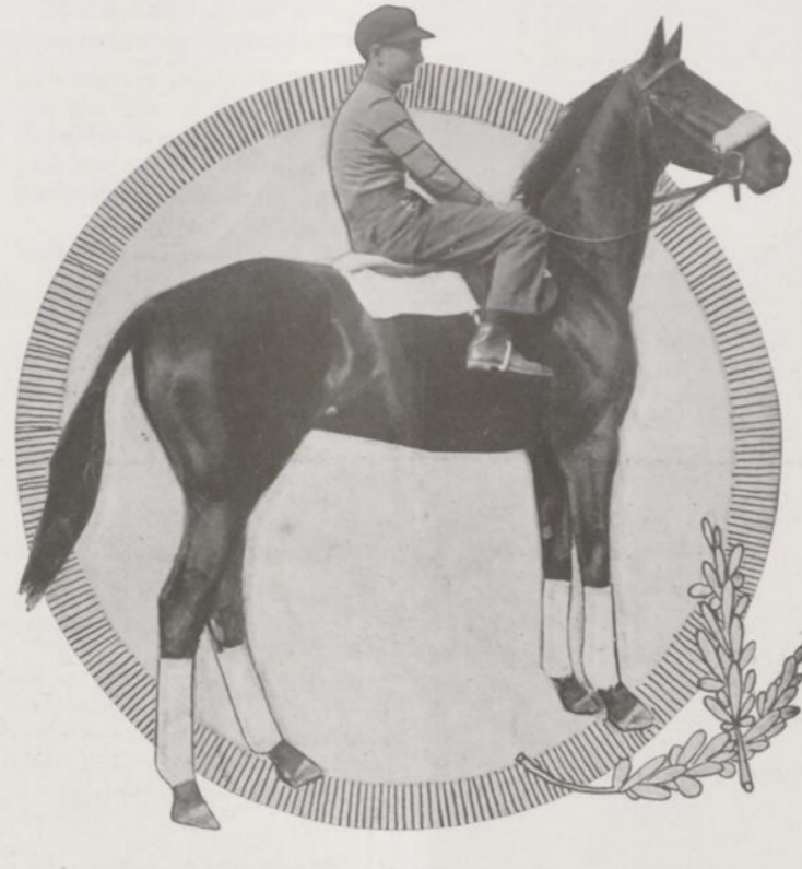
A FAMOUS WINNER—Old Rose Bud, the winner of the recent great Kentucky Derby, who is entered for the coming International Derby at Dorval on June 13th.