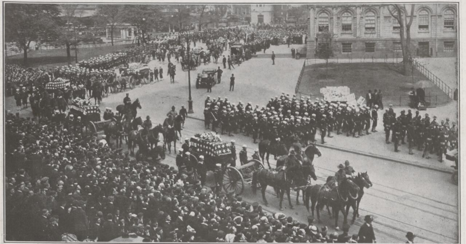
HEROES WHO WERE HONORED AS ADMIRALS—Seventeen youthful members of the United States Navy, who fell at Vera Cruz, were recently accorded military honors such as are only paid to deceased Admirals. In solemn processional march, with the President leading the mourners, they were escorted through New York, while bells tolled, flags fluttered at half-mast, and dense lines of humanity gazed silently and bared their heads to do them reverence. In the above picture the cortege is passing through the City Hall Plaza.