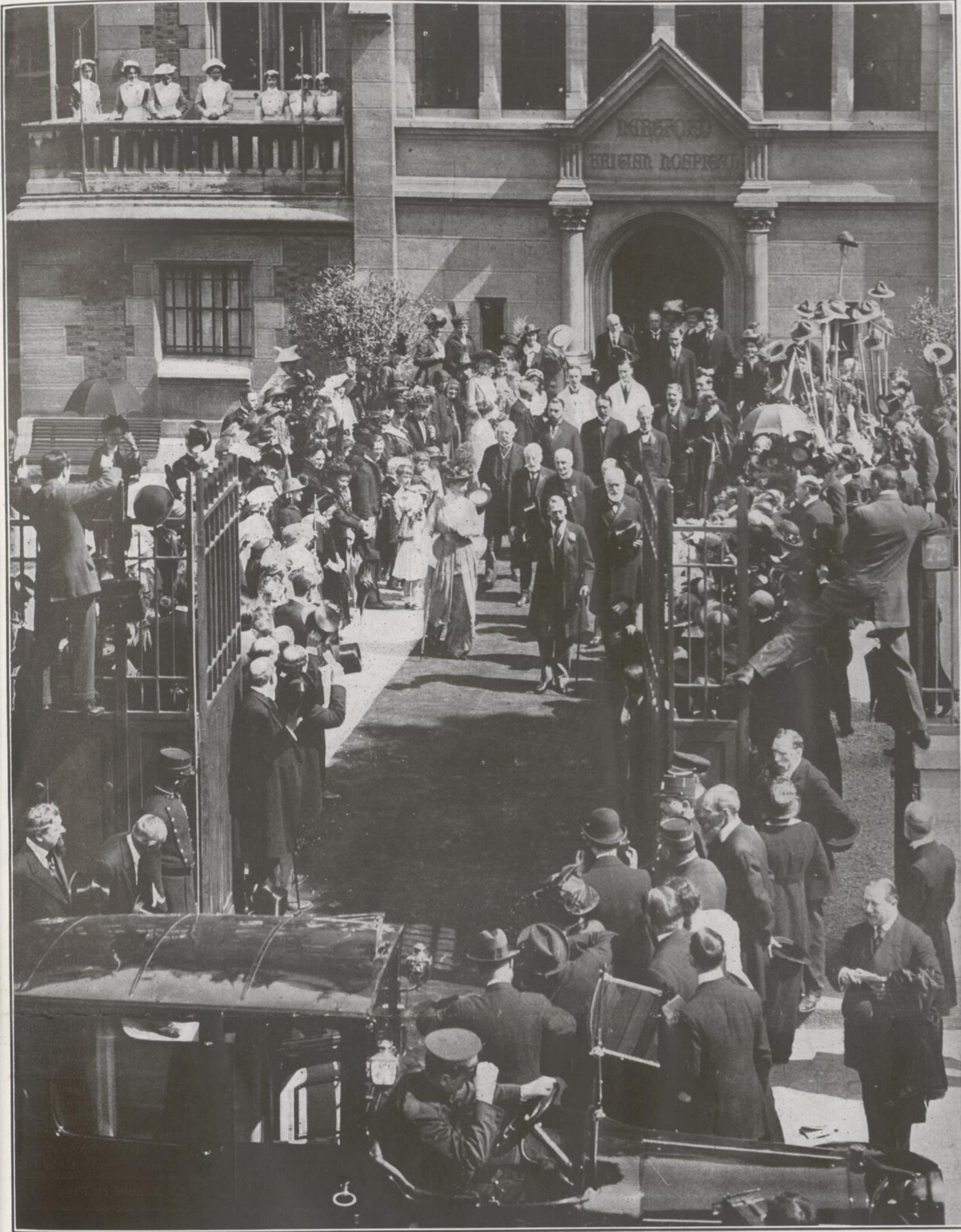
ONE OF THE PLEASURABLE INCIDENTS OF THE ROYAL VISIT TO PARIS—Their Majesties the King and Queen leaving the Hartford British Hospital—an institution that primarily exists for the purpose of caring for the British ill in Paris, although its doors are open to all. Their Majesties were tendered a remarkably enthusiastic reception at this institution, and evinced the kindest interest in the patients. In the above picture they are seen returning to their motor car after completing their tour of inspection of the building.