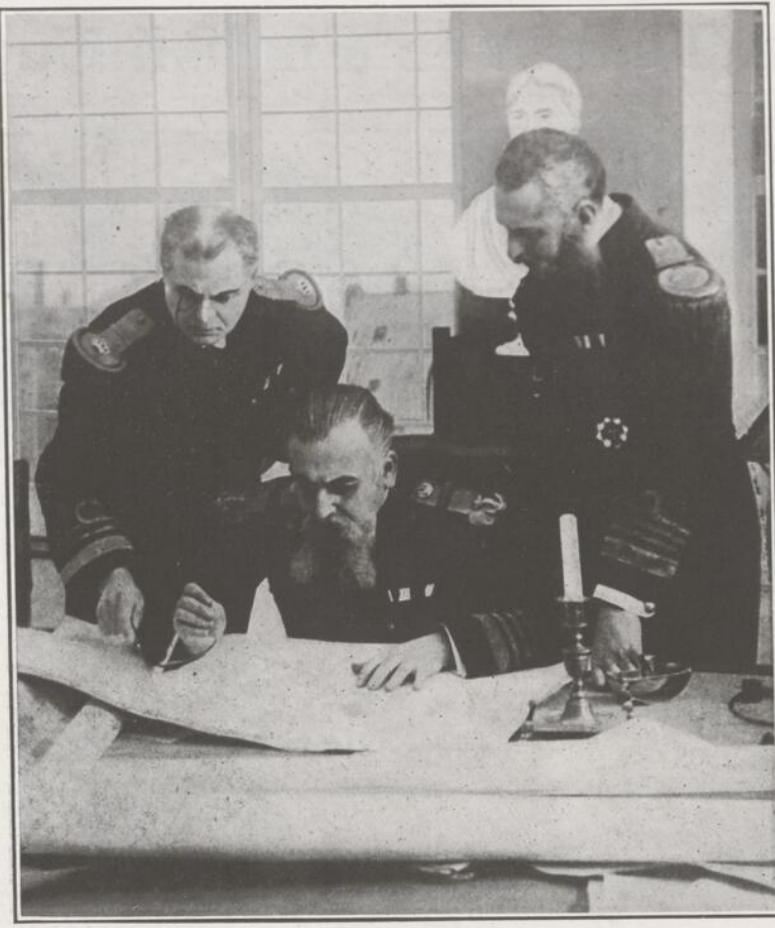
IN THE THEATRICAL WORLD—Scene from "Sealed Orders" at the Princess Theatre all next week.